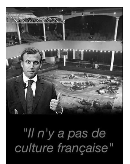
Figure 2: Twitter meme about Macron

graphical memes that depicted politicians as being globalist, pro-immigration and anti-'native' cultures. This graphic was also shared in tandem with another in figure 3.