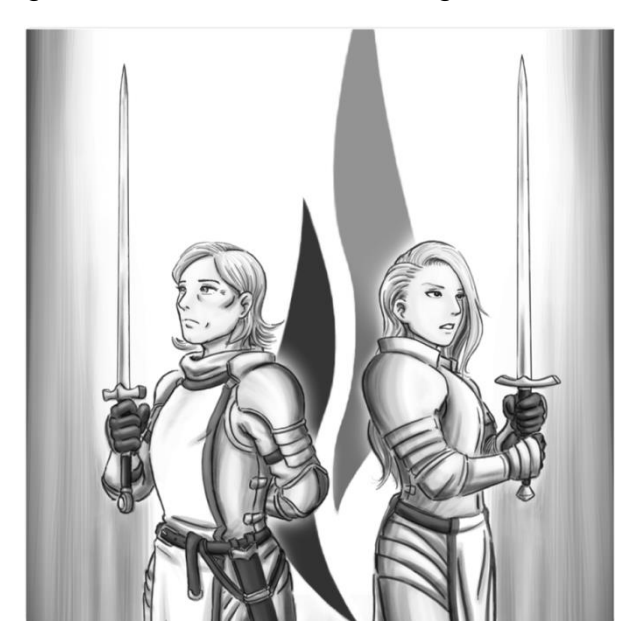
Figure 3: Twitter meme showing Marine le Pen and her niece as defenders of France