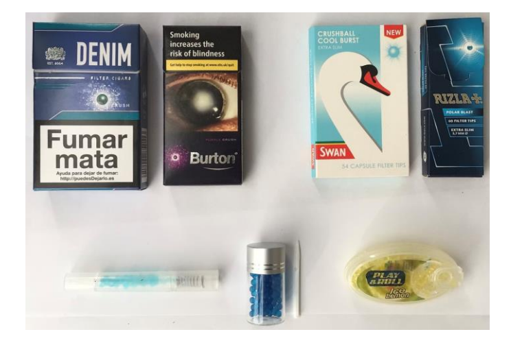
Figure 2: Capsule cigarillos (Denim [Spain], Burton [UK]), capsule filter tips (Swan [UK], Rizla [UK]), and loose capsules (from left to right [Turkey, Portugal, Spain]) in European countries with a flavour ban

Supplementary Figure 6: Make-your-own capsules, in multiple flavours, in Spain post-