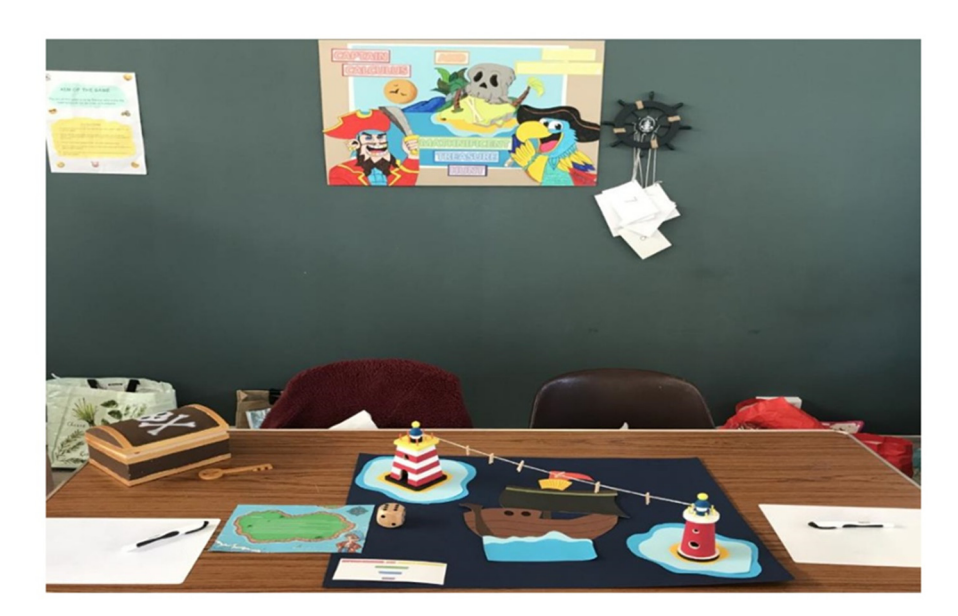
Figure 2. "Captain Calculus and Parrot Pythagoras' Mathnificent Treasure Hunt," about patterns and relationships (Pupils choose an envelope containing a pattern to solve using whiteboards and identify and explain the rule).