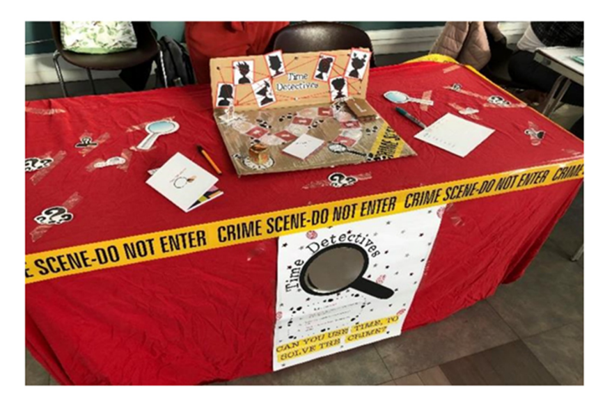
Figure 3. "Time Detectives," about time intervals (pupils study evidence files and clues to find out the time of an incident).

The product we created ( . . . ) required students to work—individually or in small teams—to form patterns using given concrete materials from an envelope of their choice, which covered a variety of curricular areas. A mixture of fractions, decimals, geometrical shapes, geometrical concepts such as perimeter and complex number sequences including squared and prime numbers were mixed up in their sets to be subsequently ordered. Pupils were then given opportunities to explain their thinking processes and reasoning for their sequence to demonstrate understanding. (from David's reflective essay)