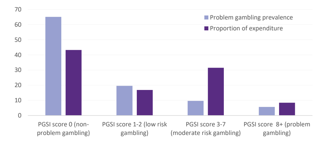
Figure 1: Problem Gambling Severity Index status among online sports bettors and the proportion of total expenditure accounted for by each group