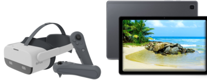
Figure 2: MOTUS Relieve system, VR headset and tablet displaying 360° content.