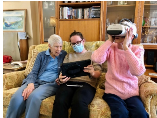
Figure 5: Participants at the implementation site interacting with MOTUS Adventure (left) and Relieve (right) with the support of researchers

to provide an indication in this preliminary study on the general suitability of VR treadmills when considering participants scores on the physical functioning measures.