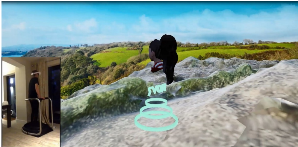
Figure 4: Example of a virtual heritage site participants could explore by walking on the MOTUS Adventure