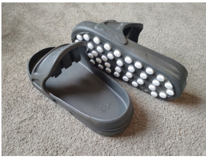
Figure 3: Overshoes to be worn on MOTUS Adventure.

within the supported living house and were generally independent but had staff on site who provided cooking, cleaning, site management and instrumental support where required for activities of daily living, but not personal care. Of the 12, seven agreed to participate.