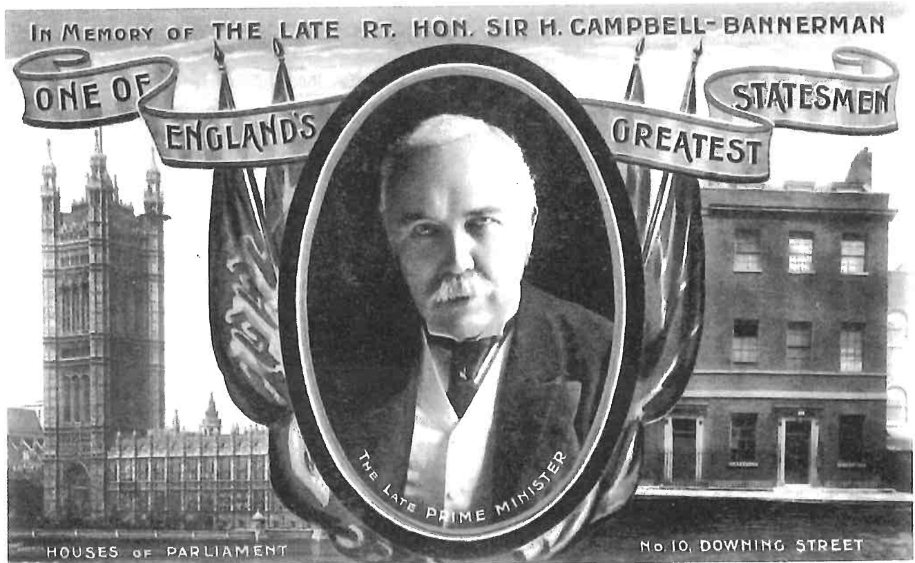
Commemorative postcard, 1908