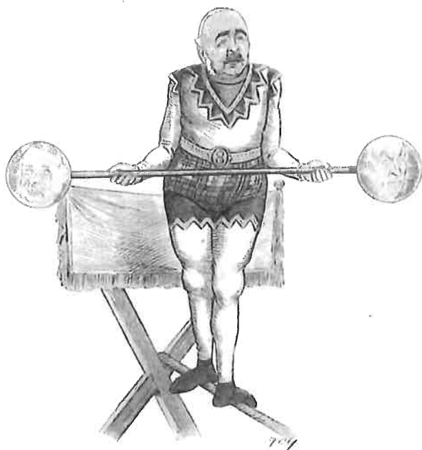
BLONDIN SIR HENRY CAMPBELL-BANNERMAN.

Francis Carruthers-Gould, 'Blondin: Sir Henry Campbell-Bannerman', n.d. [1904?] (Charles Blondin (1824–97) was a famous tightrope-walker)