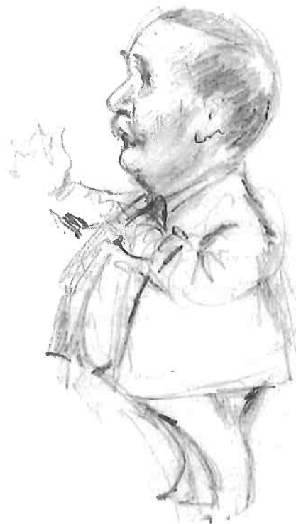
Sir Henry Campbell-Bannerman; pencil sketch by Sir Leslie Ward, 1890s–1900s

For industrial workers, Campbell-Bannerman wished to protect Trade Unions' right to strike, which had been weakened by the 1901 Taff Vale judgement which held unions responsible for any damage incurred during a strike. This view helped to strengthen the alliance with the LRC which had been re-founded as the Labour Party in 1906, following the election of twenty-nine Labour MPs as a result of the electoral pact they had previously agreed. Although he initially went along with his cabinet in agreeing to a merely partial reversal of the judgement, on listening to the arguments put forward by the Labour MPs he spoke in favour and voted for the bill they proposed rather than his own government's bill. 13