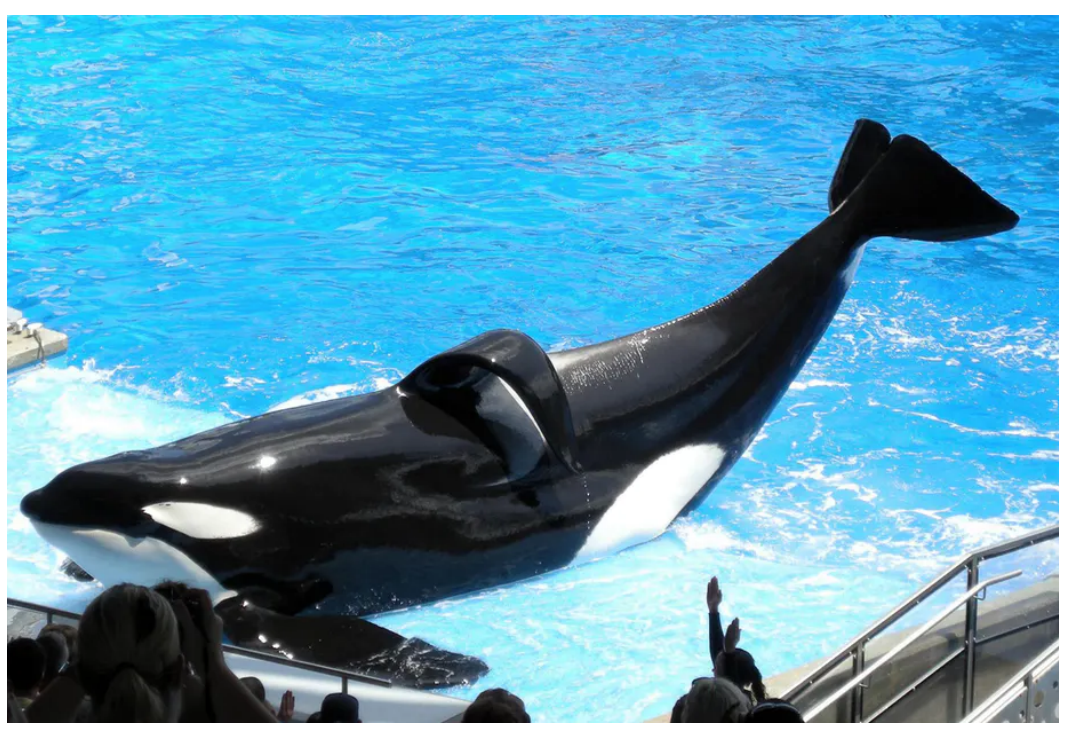
Tilikum, the orca who killed three trainers, was captured at the age of two and performed for most of his life.

After its premiere at the Sundance Film Festival in January 2013, the documentary <u>Blackfish</u> reached nearly 21 million viewers within its first month of airing on CNN. The film tells the bleak story of Tilikum, a performing orca at the US marine park SeaWorld.