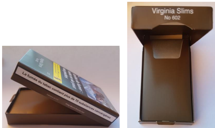
Figure 5: Shoulder boxes used for some brand variants in France.

that can be reclosed or re-sealed after it is first opened, other than the flip-top lid and shoulder box with a hinged lid'. 9 Shoulder boxes may undermine the salience of the pictorial warning on the pack front by rendering it less visible when the pack is opened (see Figure 5). Although there is no evidence to date that shoulder boxes have been introduced in the UK for cigarettes, post-standardised packaging, a regulatory option would be to permit only flip-top packs, as is the case in the two non-European countries (Australia and New Zealand) with standardised packaging. 44