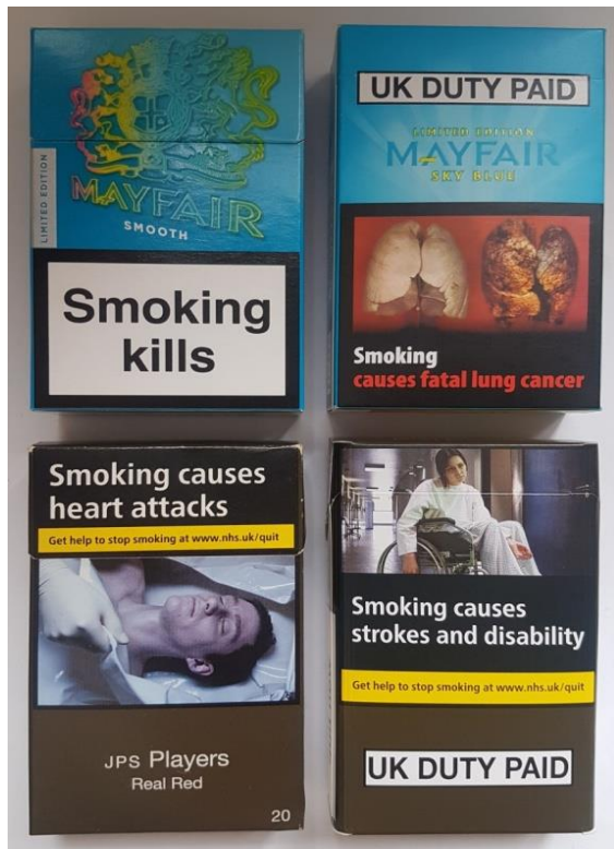
Figure 1: Example of fully-branded pack and standardised packs (pack front and reverse shown for each)

Standardised packs are not allowed to feature any other markings or financial incentives (such as price-marks), or information which promotes a product or encourages consumption by creating an erroneous impression about its characteristics (e.g. that it is less harmful than other brands) or any reference to taste, smell or flavour. The legislation also sets a minimum pack size of 20 sticks for factory-made cigarettes and 30 grams for hand-rolling tobacco. Factory-made cigarettes must come in flip-top packs or shoulder boxes, and be cuboid shaped, although bevelled or rounded edges are permitted.