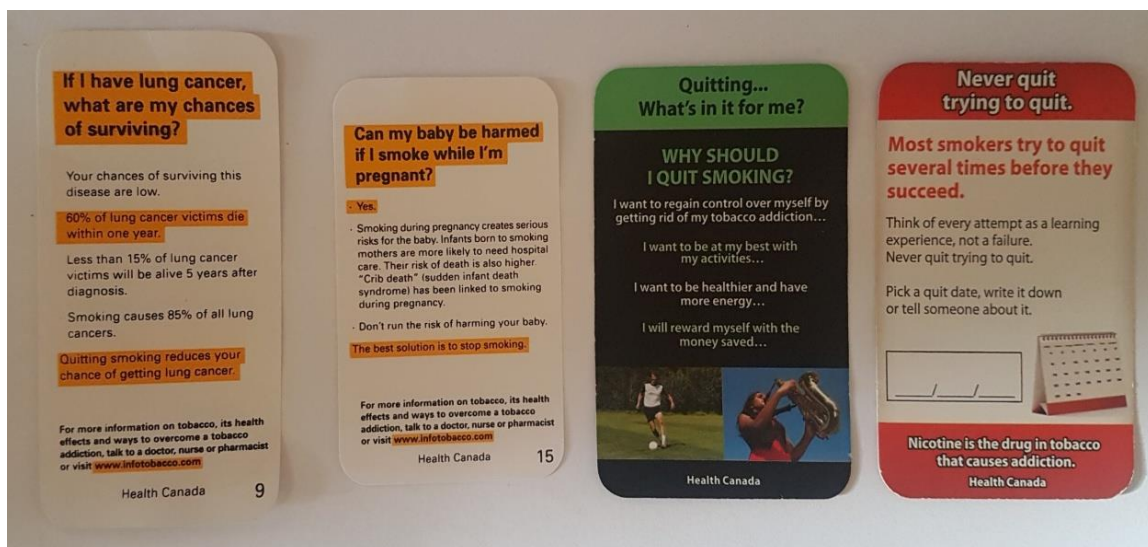
Figure 8: Examples of the first set of inserts (white background with yellow highlight), and second set of inserts (with coloured graphics) used in Canada

compared to smokers who had not read the inserts. 66 More frequent reading of inserts was also associated with greater self-efficacy to quit, increased quit attempts, and sustained quitting at follow-up. 67 Focus group research in the UK exploring perceptions of the inserts used in Canada found that these were viewed favourably, and were thought to have the potential to encourage quitting among some smokers, particularly younger people and those wanting to quit. 68 An online survey with smokers from across the UK found that three-fifths of the sample indicated that inserts would be a good way to provide information about quitting, and just over half indicated that inserts would make them think more about quitting, help if they decided to quit, are an effective way of encouraging smokers to quit, and supported having them in all packs. 69