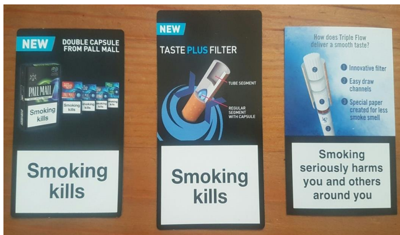
Figure 7: Inserts used to communicate filter innovation

As a result of the Tobacco Advertising and Promotion Act and the standardised packaging regulations, tobacco companies are no longer allowed to use pack inserts to promote their products. A House of Commons Science and Technology Committee report states that the UK Government should review the ban on inserts post-Brexit as it has prevented tobacco companies from using them to make claims about the relative health benefits of switching to e-cigarettes. 63 However, allowing tobacco companies to design inserts aimed at switching to alternative, non-combustible nicotine containing products has been questioned. 64 In Canada, tobacco companies have been required to include health-promoting inserts, designed by Health Canada, in packs since 2000. The first set of 16 inserts encouraged cessation or provided detailed health information to complement the on-pack warnings. 65 In 2012 a second set of eight inserts were introduced, with coloured graphics and messaging highlighting the benefits of quitting or providing tips on how to do so; none of these inserts mention e-cigarettes, but two contain the message 'Nicotine is the drug in tobacco that causes addiction'. Figure 8 shows examples of the first and second set of inserts in Canada. A third set of inserts will be introduced in Canada from 2021.