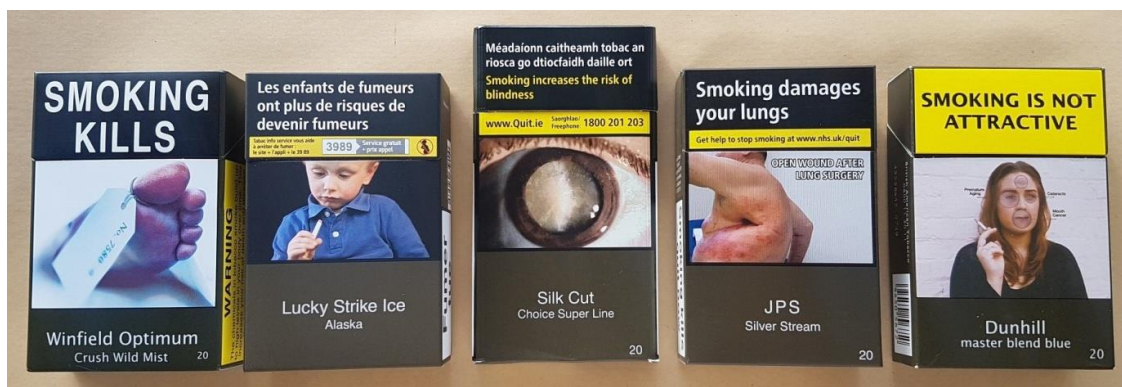
Figure 6: Variant names on plain packs in Australia, France, Ireland, UK and New Zealand

No research has explored the impact, if any, of the new variant names on standardised packs in the UK, but the potential of certain variant names on standardised packs to mislead consumers was identified by a systematic review and Cochrane review of the literature. 4,11 One policy option, which