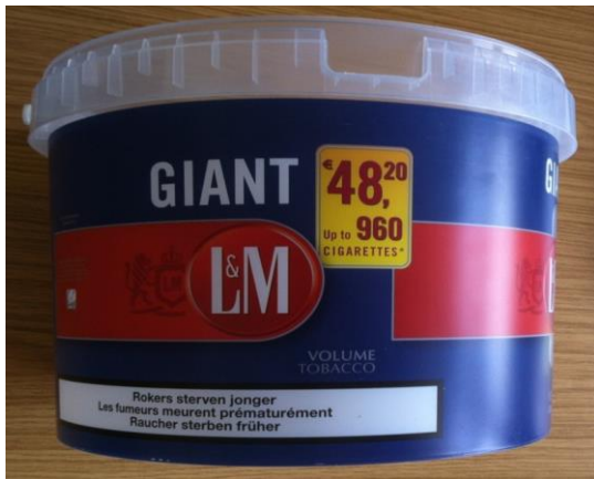
Figure 2: Pack in Belgium containing enough loose tobacco for up to 960 cigarettes

A policy option that would prevent tobacco companies from using pack size to create interest, differentiate brands, and communicate value for money, would be one or two fixed pack sizes for cigarettes and RYO. In New Zealand the standardised packaging regulations specify that packs can only contain 20 or 25 cigarettes, and 30 grams or 50 grams of rolling tobacco. In Russia, only 20 packs are permitted for cigarettes, as packs with fewer cigarettes are considered more affordable and packs with more cigarettes better value for money. 44 As retailers interviewed shortly after standardised packaging became mandatory stated that the specification of minimum pack sizes had made ordering and storage easier, because there were fewer pack sizes on offer, 28 stipulating fixed pack quantities may aid retailers' inventory management.