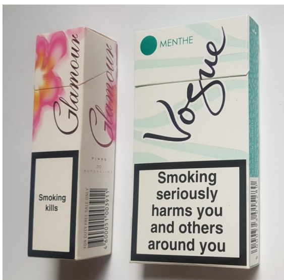
Figure 4: Slim pack formats: Lipstick type pack on left that is banned, and slimmer pack format on right that is still sold post-standardised packaging

For the slimmer packs that are still available on the UK market, it has been suggested that these may breach the Tobacco and Related Products Regulations, given that the text warnings on the side of the pack, which must be 'at least 20mm wide', are between 8-12mm wide. 44 To prevent pack shape being used to differentiate brands and potentially increase appeal or mislead consumers about product harm, a regulatory option would be to permit only straight-edged standardised cigarette packs, and specify that the depth of the pack must be at least 20mm. These are requirements in Australia and New Zealand, and no bevelled-edge, rounded-edge, or slimmer standardised packs have been identified in these markets.