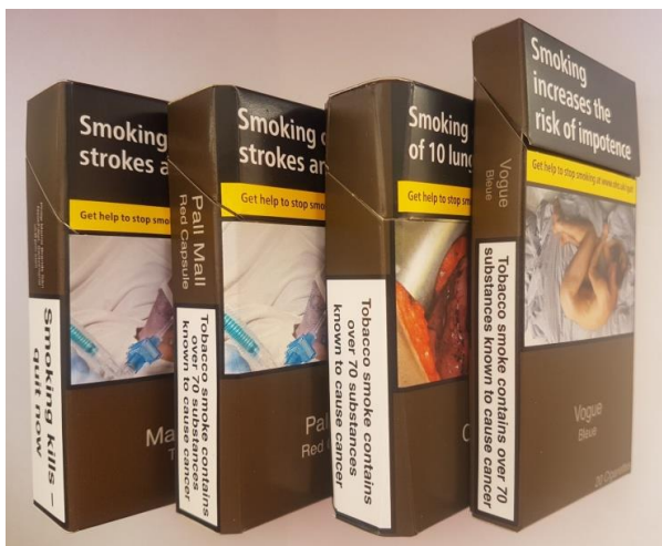
Figure 3: Standardised packs with rounded or bevelled edges, or that are slim

It is not clear what impact, if any, these particular shapes have when the packaging is otherwise uniform and unappealing. While some marketers argue that pack shape constitutes tactile branding, 46