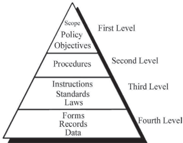
Figure 3. Documentation pyramid for OHSAS Standard.

Documentation provides evidence. Documentation is proportional to the level of complexity, hazards, and risks concerned and is kept to the minimum required for effectiveness and efficiency. The basis of the documentation is shown in Figure 3.