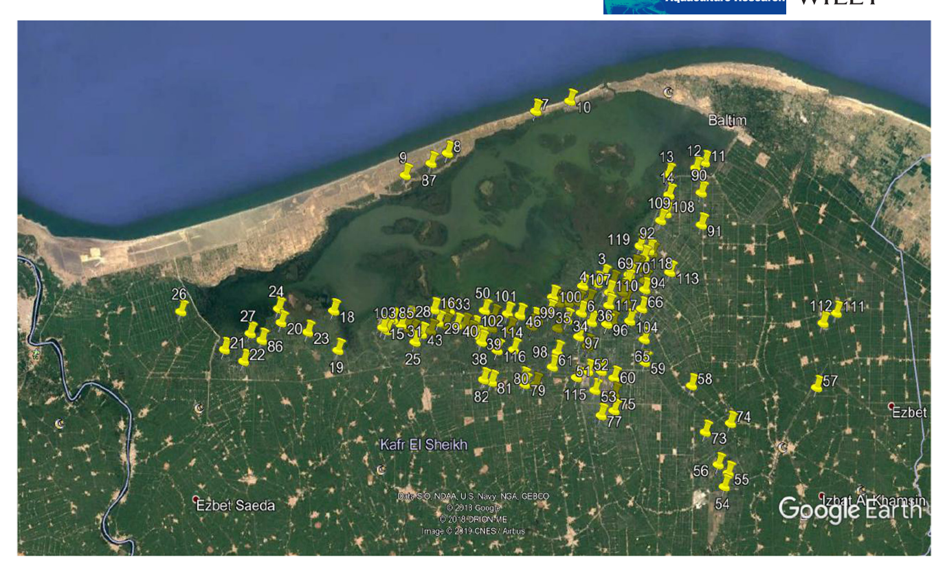
FIGURE 1 Locations of the Nile tilapia (Oreochromis niloticus) farms surveyed in Kafr El-Sheikh governorate, Egypt

University, Egypt (approval number: IAACUC-KSU-21-2018) and the University of Stirling's General University Ethics Panel (GUEP546).