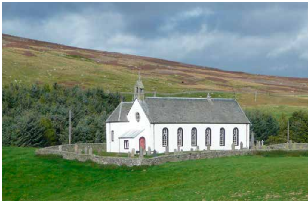
Amulree Kirk, a category B listed building in Strathbraan, Perth and Kinross