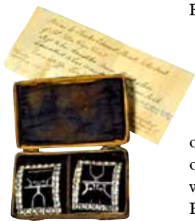
A pair of paste shoe buckles – purportedly once the property of and worn by Prince Charles Edward Stuart – with an accompanying note of their provenance