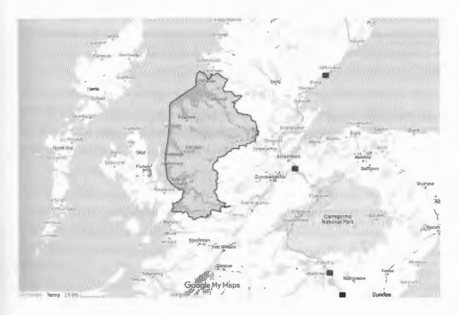
Fig. 3. Wester Ross UNESCO Biosphere Reserve outer boundaries. Created by biosphere staff and reproduced with permission.

Gramsci is useful for critical qualitative research, given his emphasis on the historicity of language and operations of power. Pre-empting post-structuralism, he argued that "history and historical residues within language are fundamental in operations of power, prestige and hegemony [with] meaning created by language in its metaphorical development with respect to previous meanings."32 Applied to this research context, language is key to how nature is understood by policymakers and shapes the possibilities for how to manage it.33 To operationalise the critical Gramscian theory of discourse for analysis, data was interpreted through the key concept of "common sense," which is rooted in historical materialism and the politics of hegemony. Common sense reters specifically to the reproduction of elite and dominant ideologies in everyday life.34 In the production of common sense, consent is garnered