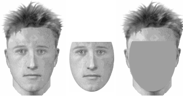
Figure 1. Example stimuli of the UK pop singer Ian 'H' Watkins. Participants inspected complete composites (left), internal composite features (centre), or external composite features (right).

Three sets of composites were used. These were the set of 40 from Frowd et al. which had been constructed from E-FIT, PRO-fit, Sketch and EvoFIT, referred to as 'complete' composites, plus two additional preparations: a set containing the internal features and another set containing the external features. The internal composite features were prepared in Adobe Photoshop by highlighting the internal facial features of these composites in the shape of an oval and then truncating just above the eyebrows, to omit the forehead that sometimes contained hair. As can be seen in Figure 1, the external composite features were produced by simply covering the previously defined internal features with a uniform grey mask.