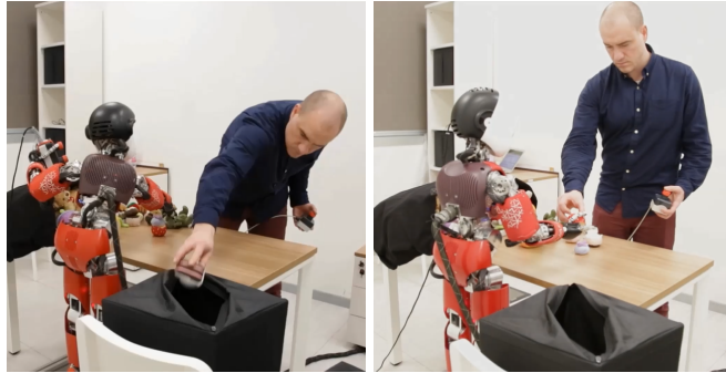
Fig. 1. Screenshots of the video stimuli: Low Coordination (left) and High Coordination condition (right).

chain in which the human grasps toys and passes them to the robot, whereupon the robot drops them into the container (Figure 1, right). In the High Coordination condition, the video lasts about 40 seconds; in the Low Coordination condition, the video lasts 37 seconds. In both conditions, the overall number of toys placed in the box is 4 (in the Low Coordination condition each agent puts two toys into the container; in the High Coordination condition all four toys are passed from the human to the robot).