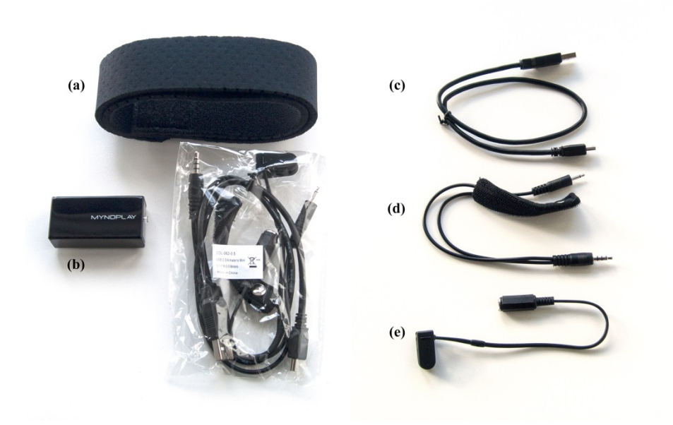
Fig. 2. The components of the MyndPlay BrainBandXL EEG Headset: (a) the headband on which the rest of the components are attached, (b) the unit that transmits via Bluetooth the EEG data to the computer, (c) the USB cable for charging the unit, (d) the two dry sensors attached to a soft material similar to the one used for the headband, and (e) the ear clip with the grounding electrode for the ear lobe.