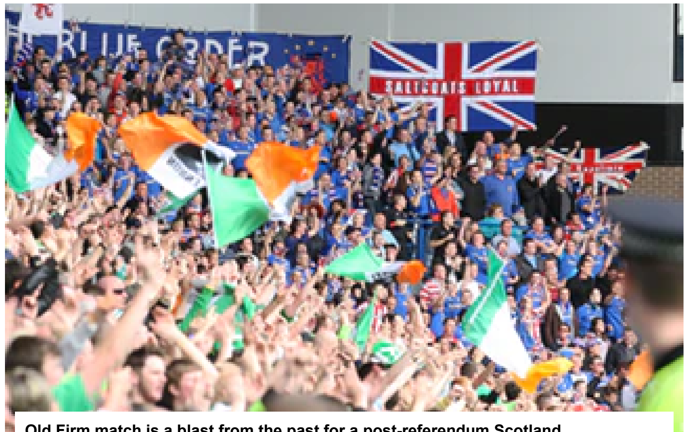
Old Firm match is a blast from the past for a post-referendum Scotland