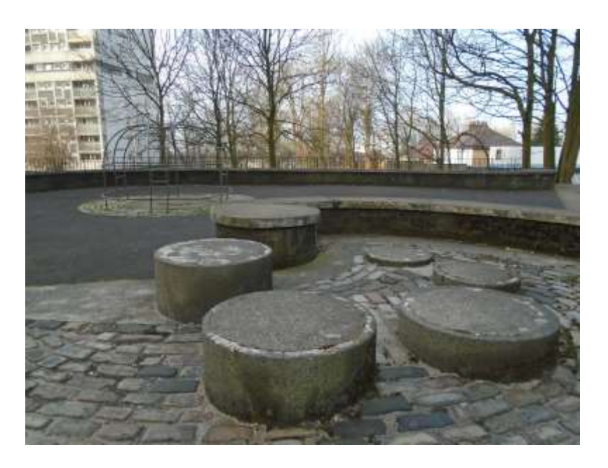
Figure 4: Playground at Broomhill high flats, Glasgow, June 2015