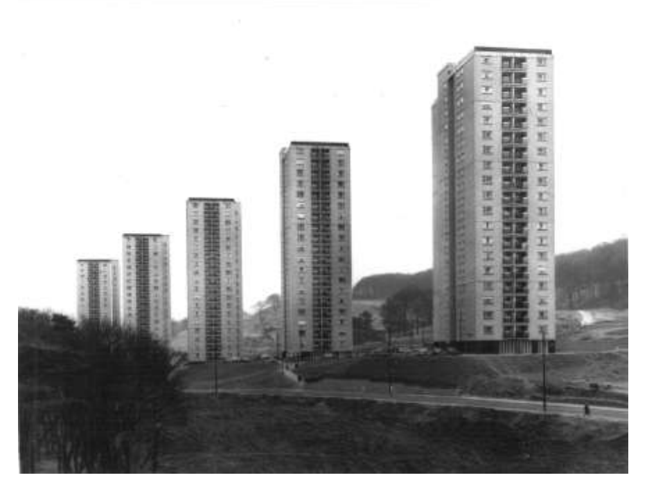
Figure 2: Mitchellhill Flats, Castlemilk (late 1960s), University of Glasgow Archive Services, Homes in High Flats Collection DC127/22a