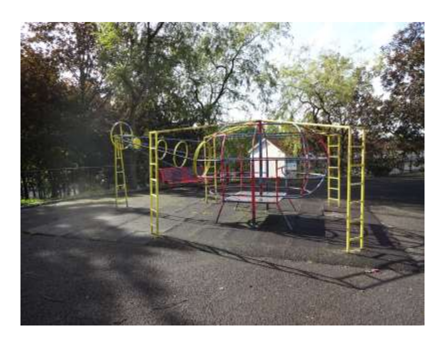
Figure 6: Playground at Moss Heights high flats, Glasgow, April 2016

In the 1990s and early 2000s we see echoes of the past and repeated shortcomings. While the planning of services and amenities moved into the realm of partnerships between public, quasipublic and third sector organisations, and community involvement was seen as central, communication was with adult representatives rather than children, despite international developments in children's rights and participation at this time. The events-led approach to city wide regeneration also continued with the development of a city marketing bureau in 2004 to attract tourists, conferences and sports meetings to the city. In this regard, selling Glasgow's image as the Dear Green Place' was important so that the upkeep and development of the city's main parks was perhaps the priority rather than caring for, or making, additional local provision for outdoor play. Access to such parks and open spaces was also very uneven and dependent on the ability to travel as determined by financial resources and the age of the child.