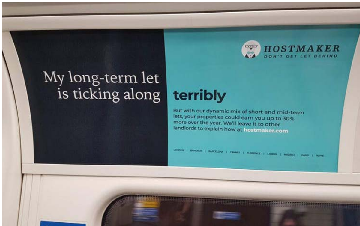
Hostmaker advert on the London tube. Generation Rent

Part of the issue is the continued commodification of housing, and the attitudes of landlords who view their properties as an investment , rather than as someone's home. This was encapsulated in recent adverts by letting company Hostmaker, which subtly promoted a move away from long-term tenants in favour of the short-term market .