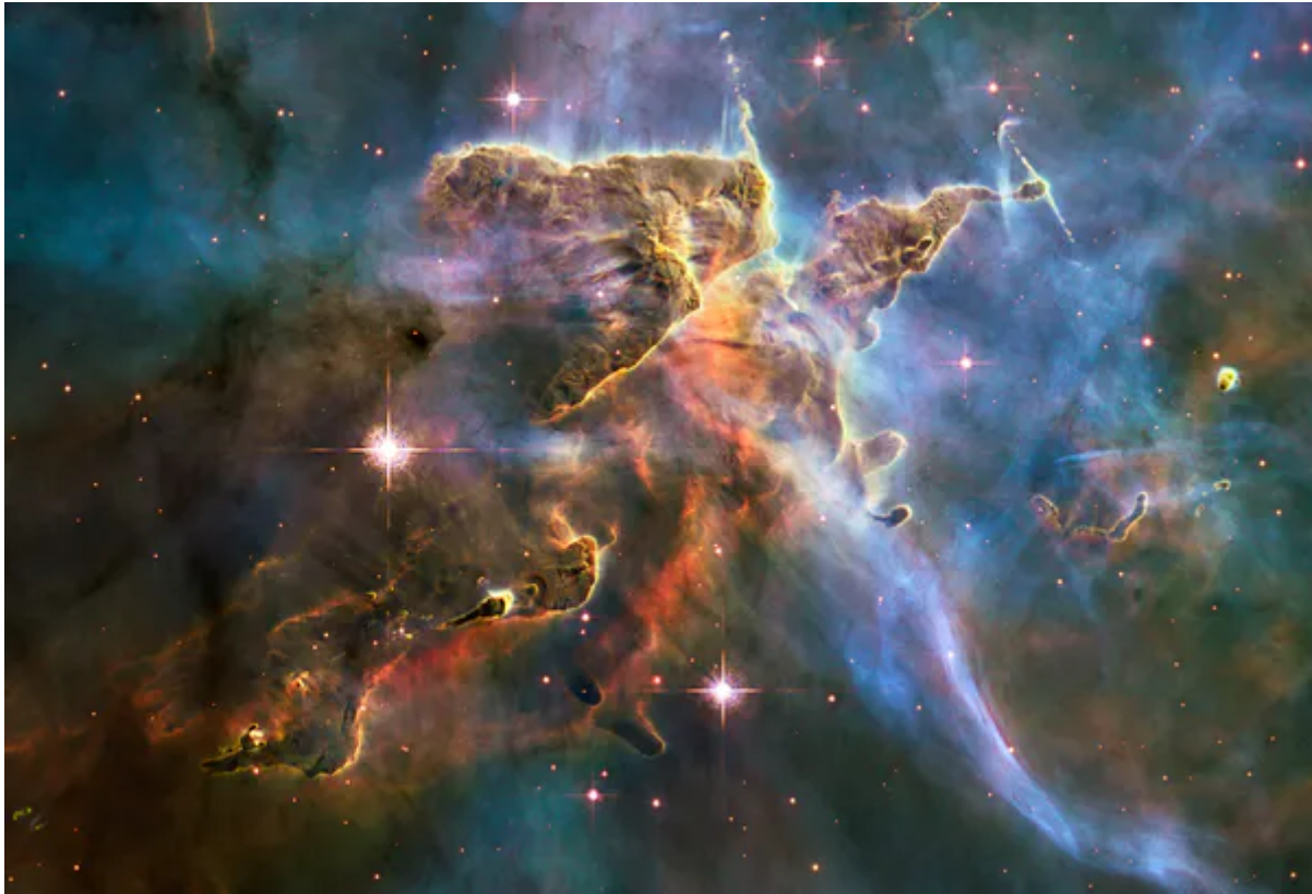
There's plenty of interstellar dust in the Carina Nebula.

The dust cloud in our solar system gradually moves towards the sun whose gravitational pull acts like a giant vacuum cleaner. On their way, some of the dust particles collide with Mars and Earth. The dust is responsible for the Zodiac light that can be seen after sunset in spring or before sunrise in autumn.