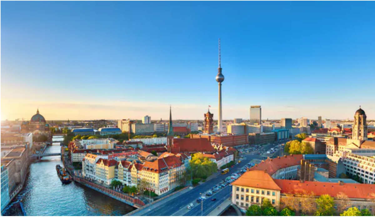
Berlin is well known for its rent controls.

Reforms need to be introduced carefully, to minimise any unintended consequences. For example, landlords might become more risk averse, which could lead to greater discrimination against tenants who claim benefits. Or, they could decide to let their property on Airbnb instead.