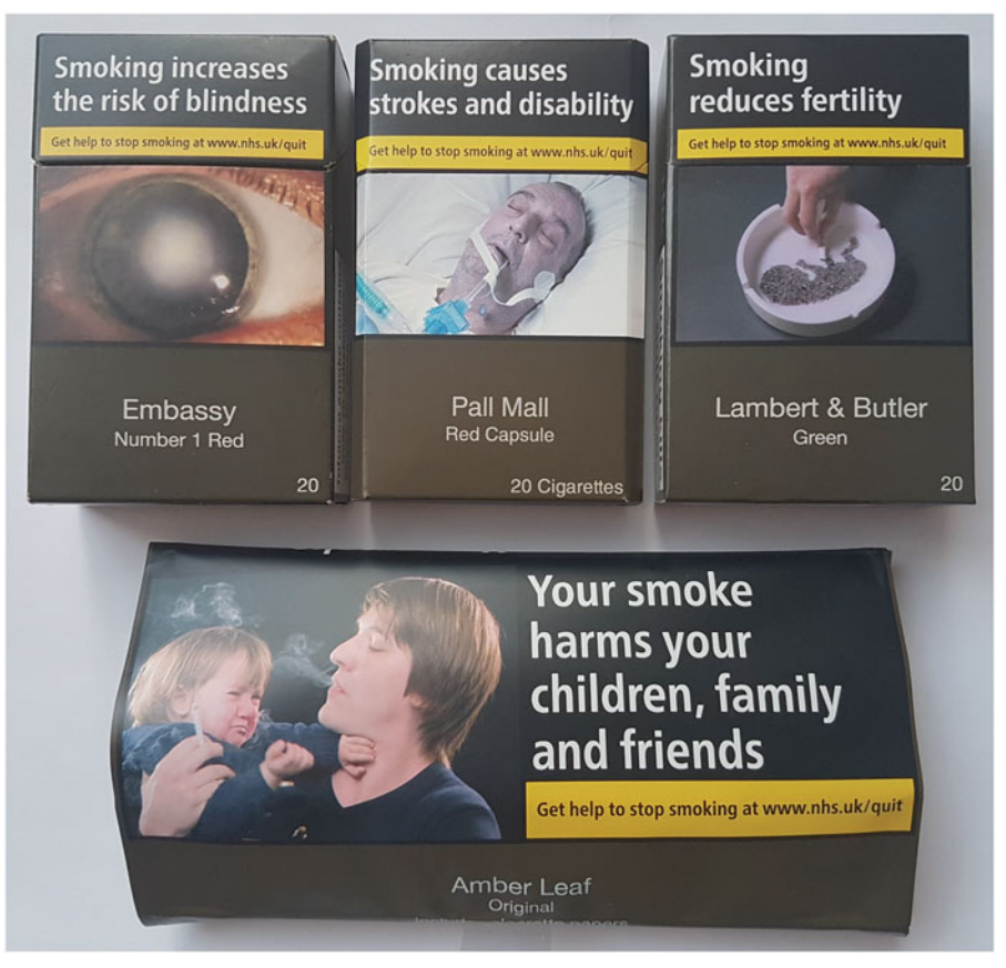
Figure 1. Standardised packs used in the survey.

Regulations (TRPR) requires pictorial warnings covering at least 65% of the principal display areas and text warnings on at least 50% of the secondary display areas. Prior to the legislation, in the UK a text warning covered 43% of the front, and a pictorial warning 53% of the back, of packs. The TRPR also requires the inclusion of cessation resource information (e.g. a stop-smoking helpline and/or web address) on each warning, with the UK Government opting to include a stop-smoking web address (Figure 1 shows standardised packaging in the UK).