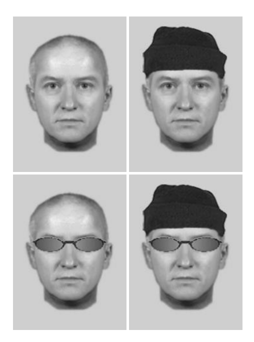
Fig. 3. Example composite constructed from memory by a participant in Experiment 3 of EastEnders' character Alfie Moon (played by actor Shane Richie), top left, and different representations, edited with selective concealments (woolly hat and sunglasses). Images were presented together as an array. In this example, the composite constructor initially saw a target photograph with inaccurate hair (a bald head in this case).