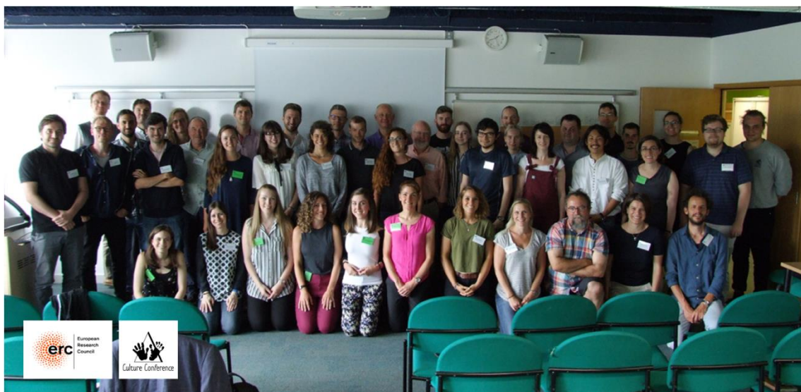
Fig 1: The attendees of the Culture Conference 2018: “Complexity in Culture”.