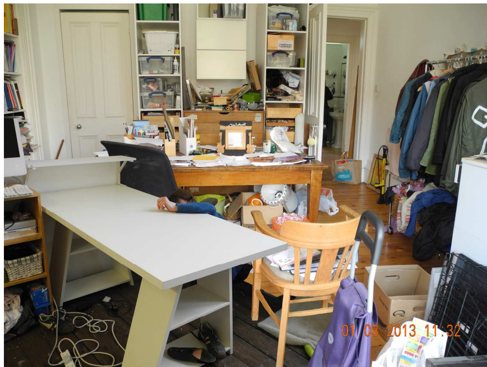
Figure 4: Tables and Toby [digital photo-collage] created by the author

1 2 3 4 5 6 7 8 9 10 11 12 13 14 15 16 17 18 19 20 21 22 23 24 25 26 27 28 29 30 31 32 33 34 35 36 37 38 39 40 41 42 43 44 45 46 47 48 49 50 51 52 53 54 55 56 57 58 59 60