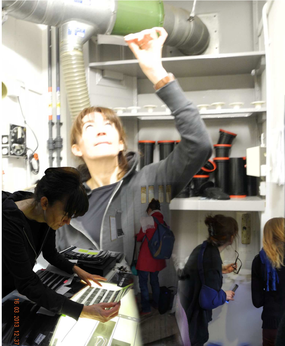
Figure 3: Keys, Bags and Negatives [digital photo-collage] created by the author

1 2 3 4 5 6 7 8 9 10 11 12 13 14 15 16 17 18 19 20 21 22 23 24 25 26 27 28 29 30 31 32 33 34 35 36 37 38 39 40 41 42 43 44 45 46 47 48 49 50 51 52 53 54 55 56 57 58 59 60