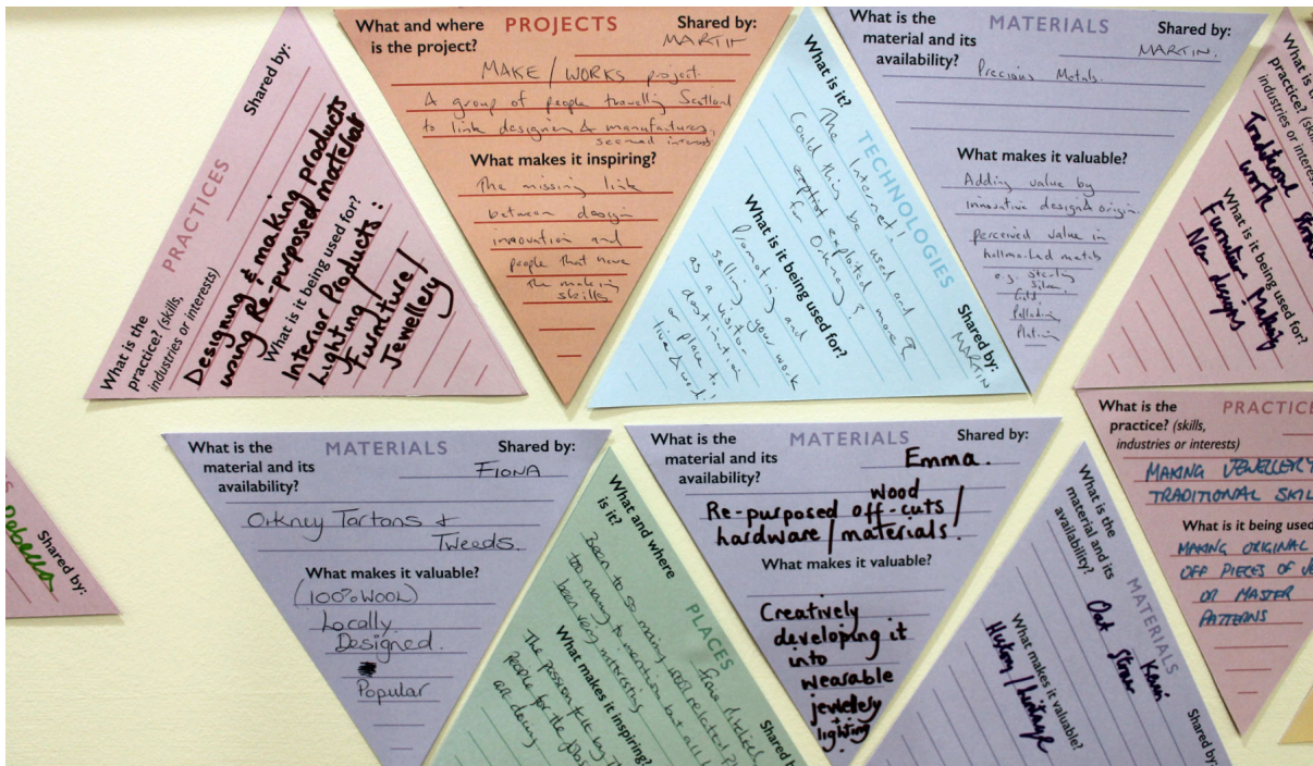
Figure 1: Wisdom Wall cards were provided to participants to categorize and capture their knowledge and insights into existing resources that could be useful in inspiring ideas around innovation of the craft and creative sectors in Shetland.