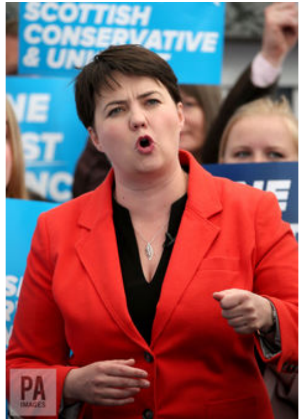
Ruth Davidson honed her message down to a rejection of a second independence referendum.

As it turned out, this analysis did not quite tell the whole story. The SNP did more than lose a few seats (21 in total, down to 35 from 56 seats in 2015). And even though they remain the largest party and won the election in Scotland, the result will, for some time, feel like a loss or at least a major setback, particularly since they experienced major losses with senior figures Alex Salmond and party deputy leader Angus Robertson.