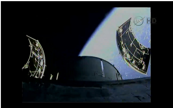
Service panel separation following the launch of Orion.

Compared to Jupiter’s icy moon Europa or Saturn’s moon Enceladus – other hotspots with the potential for life, Mars is by far the easiest to reach.