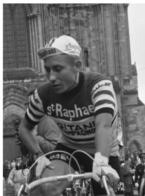
Pro-doping: Jacques Anquetil

While allowing doping would be controversial, there are comparisons. In boxing, for instance, modern-day participants know and accept the risk that they could incur brain injuries. In that sense, if all cyclists accepted the use of drugs in the sport then their decision would be a similar one based on the health risk that such drug use involves.