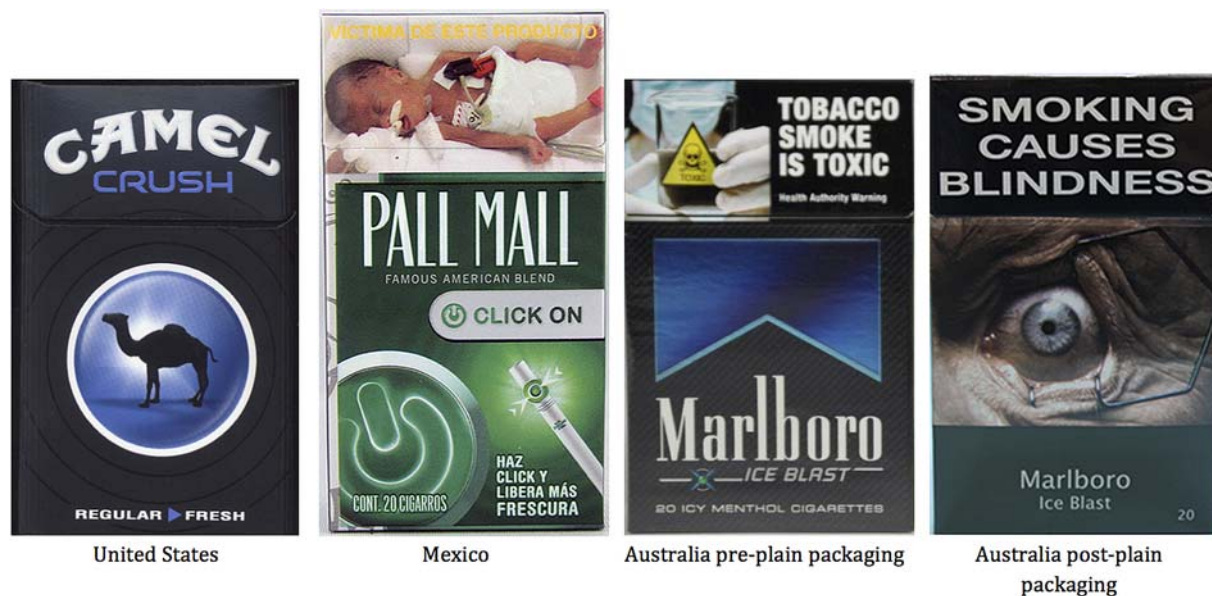
Figure 1 Example packages of brand varieties with flavour capsules in the USA, Mexico and Australia, 2014.

Brands were also classified into discount or premium price segments. For Mexico, national brands were classified as discount and international brands as premium, except for Pall Mall, as in prior research. 27 28 For the USA, we classified brands using a scheme developed in prior research that considered price and advertising image, 31 because both are critical to how the tobacco industry itself promotes premium brands. As such, this coding scheme involved assessment of pricing and tobacco industry representations of brands on industry websites and trade publications. Analyses by price segment were not