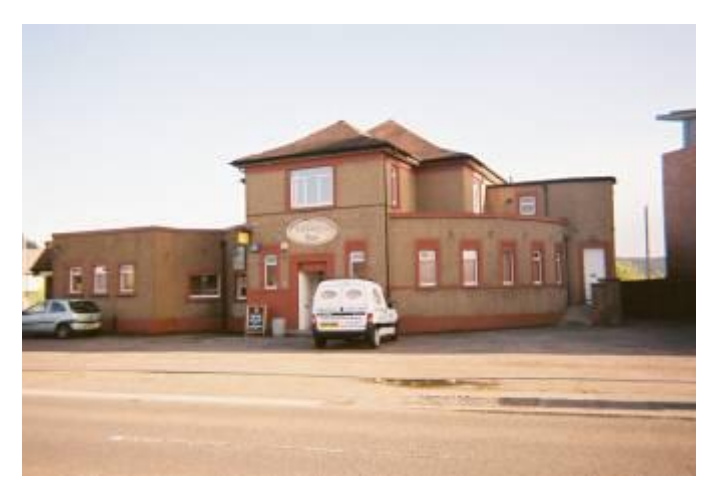
Figure 35: Marissa (2012) Bottom Pub.