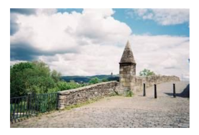
Figure 1: Jean-Luc (2012) Old Bridge and Wallace Monument.

Jean-Luc made a photo of the River Forth from the Old Bridge, as well as a photo of the Old Bridge from the Raploch side of the river. Within the interview he referred to this bridge over the River Forth as a boundary, or edge, of the Raploch; thereby emphasising territorial markers of the area: