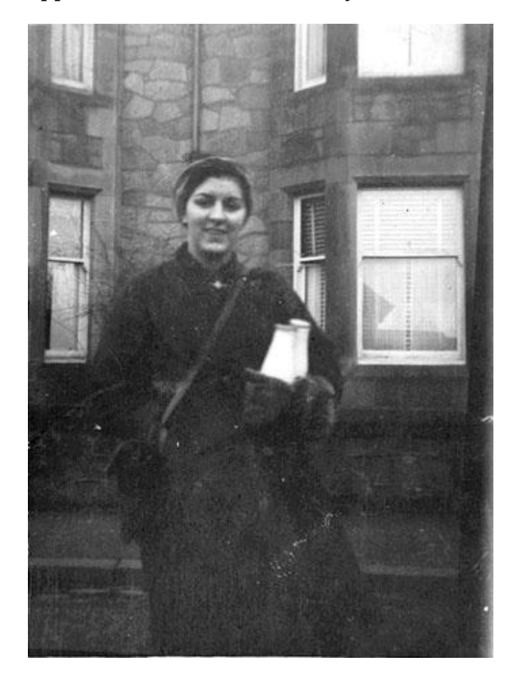
Appendix 5: Photo of a milk lady