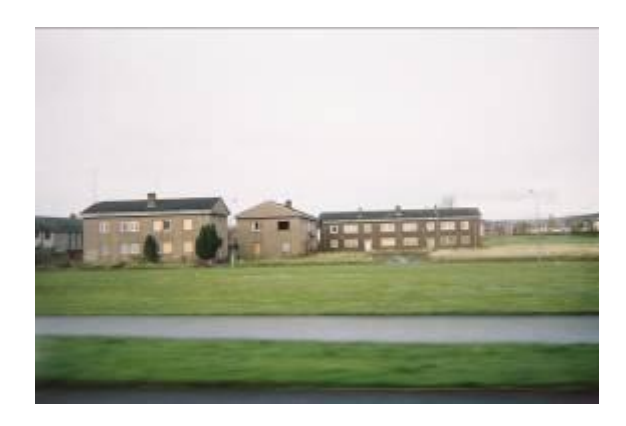
Figure 11: Martha (2013) Families Refuse to Leave.