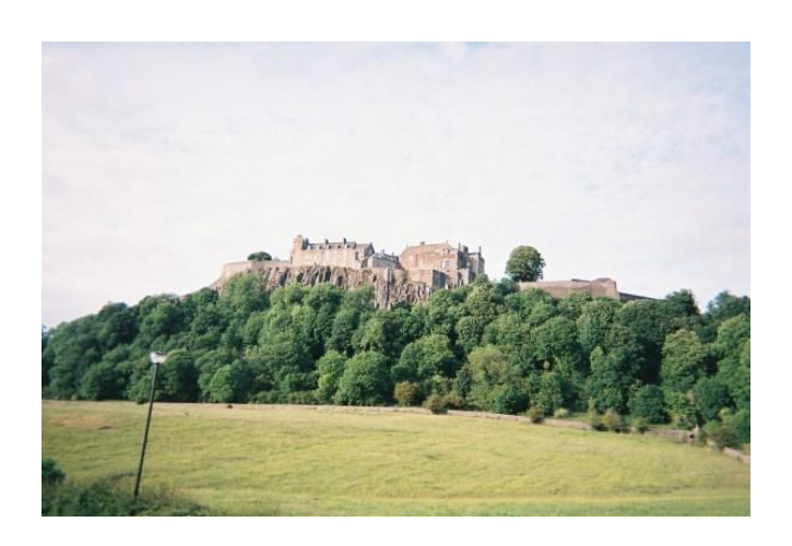
Figure 12: Kelly (2012) Stirling Castle.

Concurrently the castle was also emphasised as an everyday experience, as exemplified by Ciaran, who gave his photo (figure 8) the title 'Clean Laundry Strung Out Under the Castle'; similar to Kelly's reference to the castle as, "that's just the view of the castle".