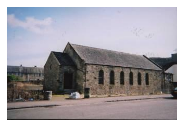
Figure 28: Jack (2012) St Mark's Parish Church of Scotland a Memory from the Past.

By contrast, Jack highlighted that the historical 1930s church hall did fit into to the area: