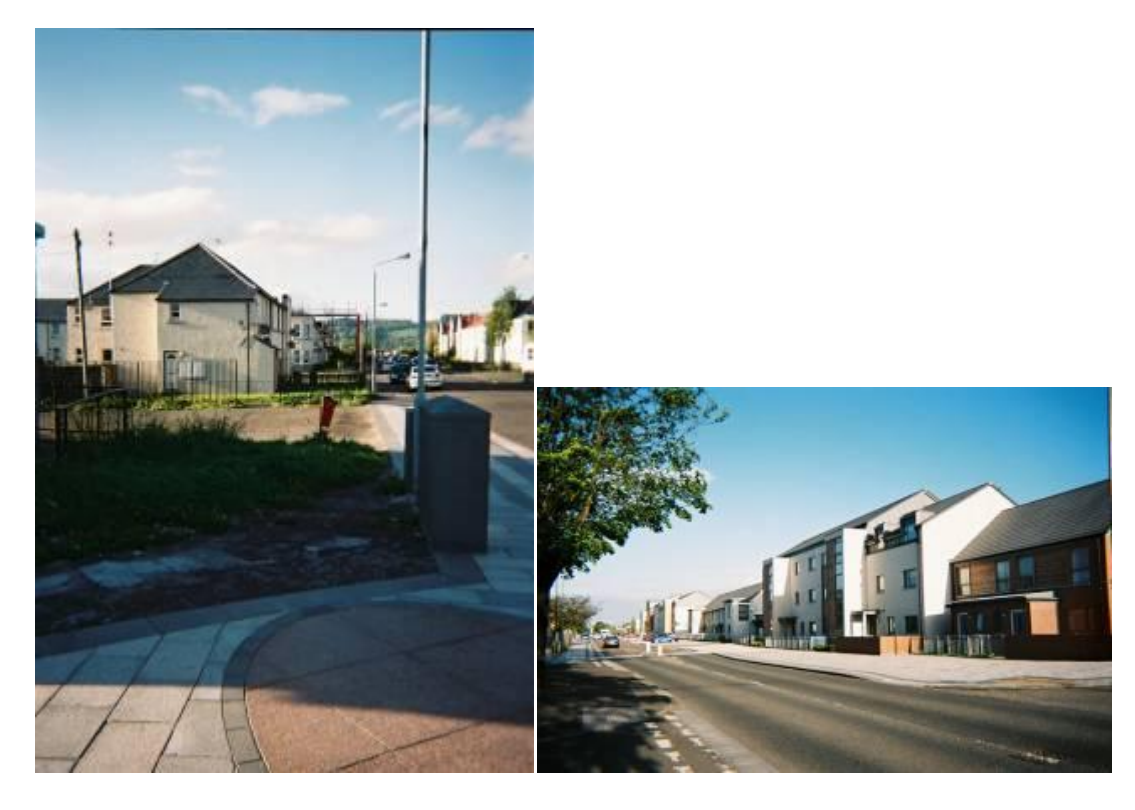
Figure 18: Marissa (2012) Old side of Drip Road. Figure 19: Marissa (2012) New side of the Drip Road.

further illustrate her perception of there being two very different areas, separated by the road.