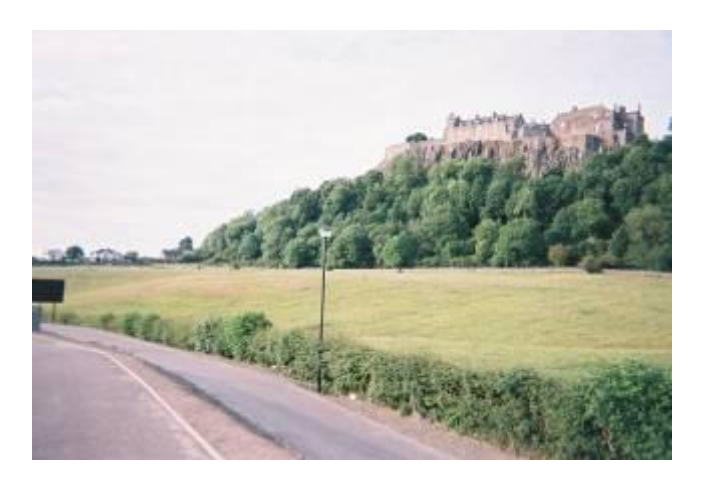
Figure 15: Kelly (2012) Castle Overlooking King's Knot.

At the same time it could be argued that participants were aware that the visual of the castle from the Raploch was limited, in comparison to the other side of the hill, as this photo from Kelly shows; she shot this image from the other side of the hill to allow the researcher a more detailed view of the castle.