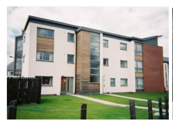
Figure 24: Jean Luc (2012) New Flats.

Equally, established residents choose to make their photos of the new houses from a distance, or from the periphery. Four (Kelly, Jack, Daniel and Jean-Luc) did not enter the new area, but rather either made photos from the periphery or from the Drip Road, Raploch Road or the newly created Village Square, as Jean-Luc's examples illustrate.