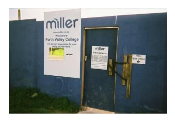
Figure 46: Bruce (2012) Untitled.

"...this whole area is getting redeveloped so they're moving the Falkirk Council or it's the Forth Valley College but it's the one that was located in Falkirk Council that is this is the whole site is getting rebuilt." (Bruce 30s)