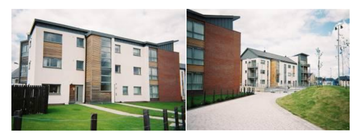
Figure 24: Jean Luc (2012) New Flats.