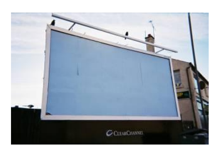
Figure 47: Bruce (2012) Untitled.

Emily on the other hand interpreted the billboards negatively, as her comment shows: