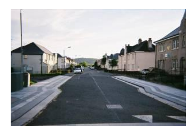
Figure 31: Bruce (2012) Untitled.

From the photo as well as the oral data there was a strong sense of two distinct and separated communities, which were separated physically by the Drip Road. This sense of two communities also became clear when Bruce described this photo, even though it shows a road in the established council housing estate he referred to it in terms of difference between the new as well as the established community: