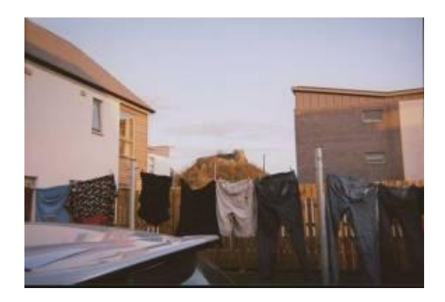
Figure 8: Ciaran (2012) Clean Laundry Strung Out Under the Castle.

The picturesque nature of the castle is a recurring theme within the interviews when referring to the photos; as with Ciaran, who described the castle as his preferred view: