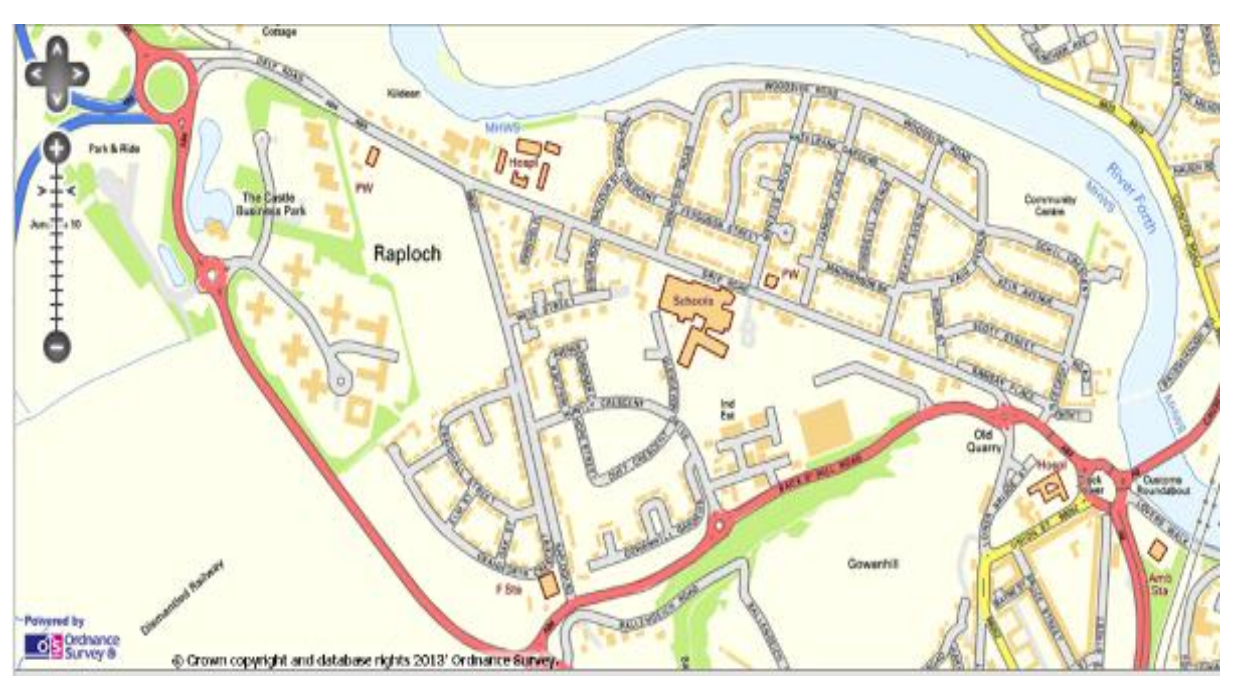
Map 2 - Raploch