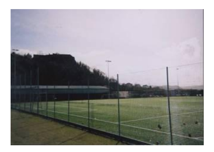
Figure 16: Jack (2012) Keeping the Kids off the Streets.

Jack created the next photo, which exemplifies the limited view of the castle from the Raploch in comparison to the other side of the hill as Kelly depicted.