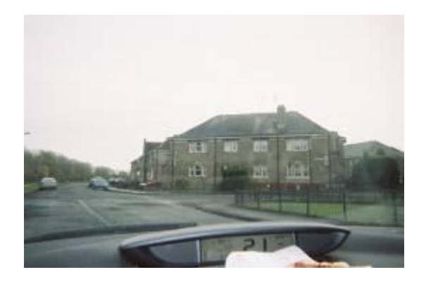
Figure 42: Martha (2013) No New Flats Here.