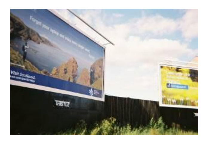
Figure 48: Emily (2012) Untitled.