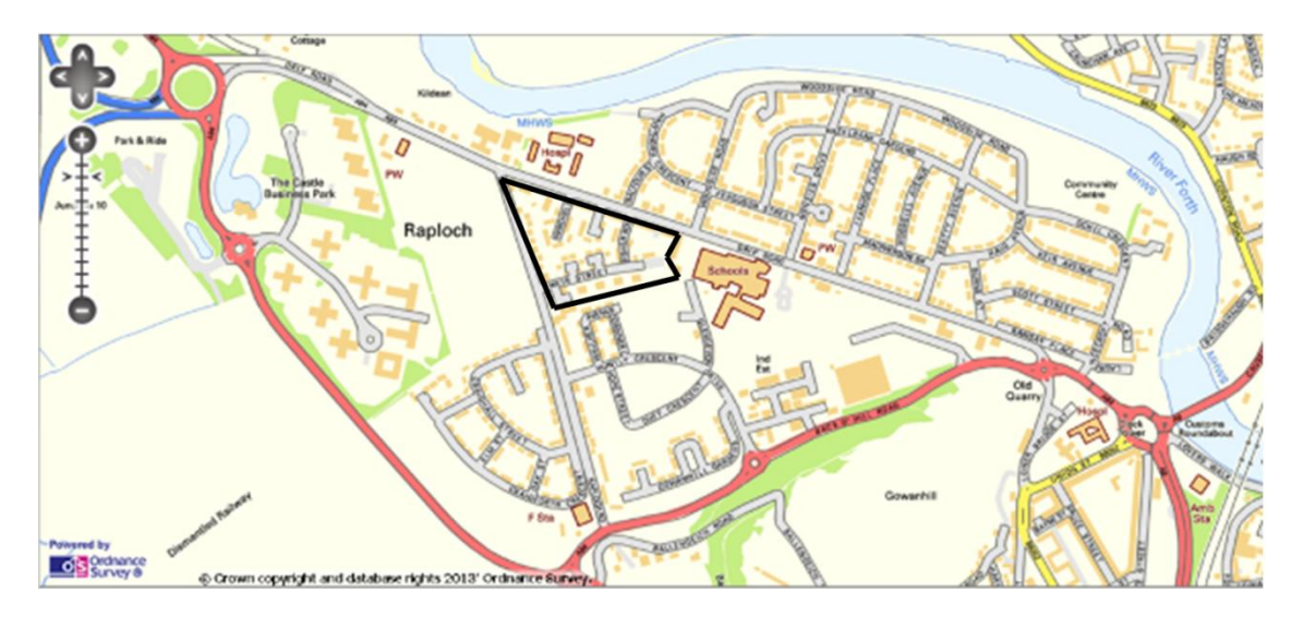
Map 3 - Site 5 of the regeneration within Raploch (outlined with thick black line)

Salvation Army there is another footpath leading to a Sainsbury's Supermarket. Further along there is brown field land and some business units. The schools and the Raploch community campus are approximately half way along Drip Road, on the south side across from the afore mentioned 'Coronation Block'. Next to the Raploch Community Campus is a large open paved area referred to as 'Village Square'. There are benches, seating and sculptures placed in the square. Next to the 'Village square' is site 5 of the regeneration development situated. The majority of high density flats are placed on the periphery of the new development (Appendix 12) on site 5 of the regeneration development.