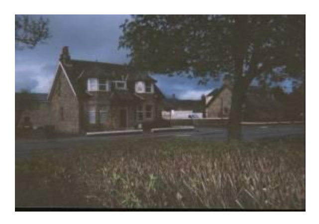
Figure 6: Ciaran (2012) Victorian Villa on Drip Road.

This exemplifies the socialisation of perception on value, which is decoded from architectural styles. This building is seen in association with wealth due to its Victorian architectural style, which semiotically does not fit into the rest of the council estate, and is therefore, as Ciaran argues, 'out-of-place' in Raploch. Therefore, newcomers, like Ciaran, were aware of the 'reputation' of the area and were trying to reframe the dominant discourse for themselves, by considering perceived positive aspects such as the historical buildings. This resonates with the famous quote by Lefebvre (1991: 26) who suggested that "(Social) space is a (social) product" full of perceptions and interpretations rather than a neutral container. These historical structures were simultaneously used by residents who had moved into the area as a form of justification for moving into a stigmatised area. This becomes apparent when considering Marissa, who mentioned, beside