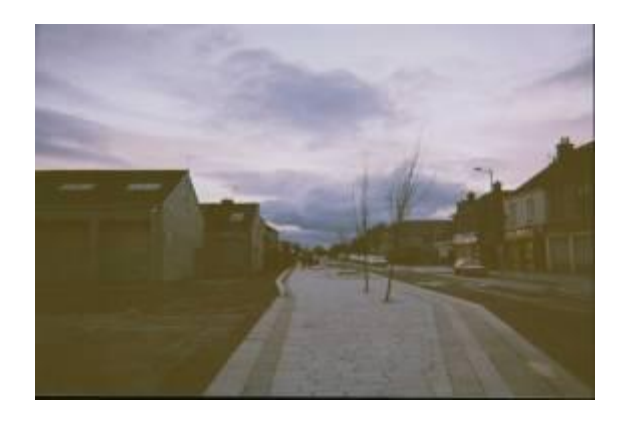
Figure 41: Ciaran (2012) Posh Granite Pavements or Cathedral Hard Landscaping in the Desert. Sprinkling Glitter on Shit Perhaps?

This, avoiding entering an area, resonates with Newman's (1972) observation of symbolic barriers, which can be as subtle as a changing ground surface, such as Drip Road, but nevertheless can produce a reluctance to cross. Simultaneously, this barrier can be a consequence of the social memory of the Raploch, as a 'sink estate' that has associations with poverty, drugs and crime, which creates fear and an attitude that the area is to be avoided as a territory by the new residents. Cultural norms and values, and their disparities, can also create boundaries between different social groups or classes, especially as these, Rapoport (1980) argued, are not only reflected in the physical built environment, but also in people's appearance and behaviour. At the same time, it could be argued that by not choosing to make photos within the heart of the historical council housing estate, this part of the area was not considered to be part of the new residents' Raploch.