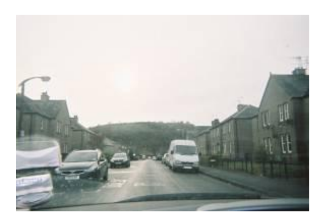
Figure 21: Martha (2013) photo 10 The Other Side to the Story