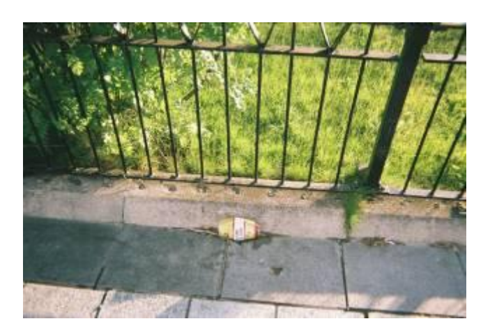
Figure 23: Bruce (2012) Untitled.

To consider the difference between the old and new, the new residents selected images other than those of the built environment, such as this one by Bruce who explained his choice in the interview.