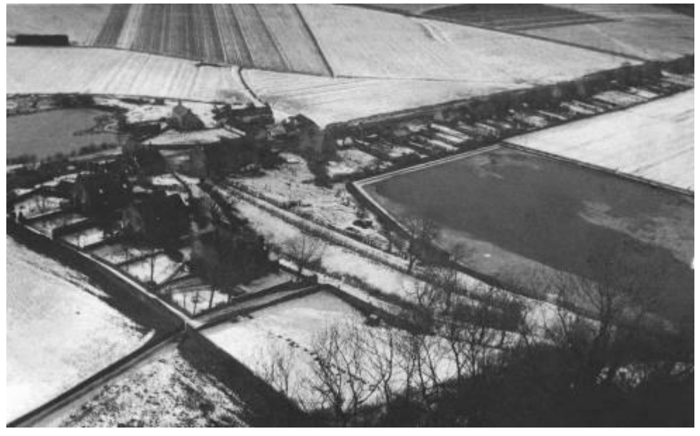
\label{eq:continuous} \textbf{Appendix 10: View of Raploch from the castle after council housing development}