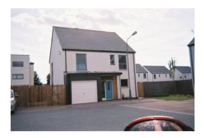
Figure 40: Emily (2012) Untitled.

For Emily the regeneration and the availability of the new houses encouraged her to move back to the area she grew up in: