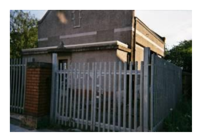
Figure 32: Bruce (2012) Untitled.

Conversely, Ciaran on the more extreme end of the spectrum, as a new owner occupier, considered himself to be a pioneer within the Raploch: