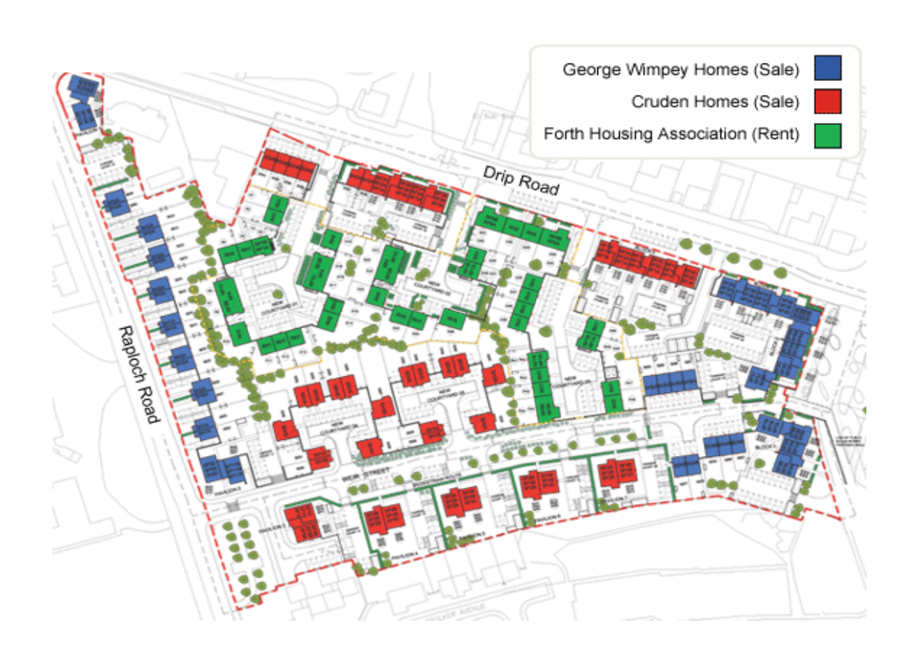
Appendix 12: Map of the newly built regenerated area in Raploch