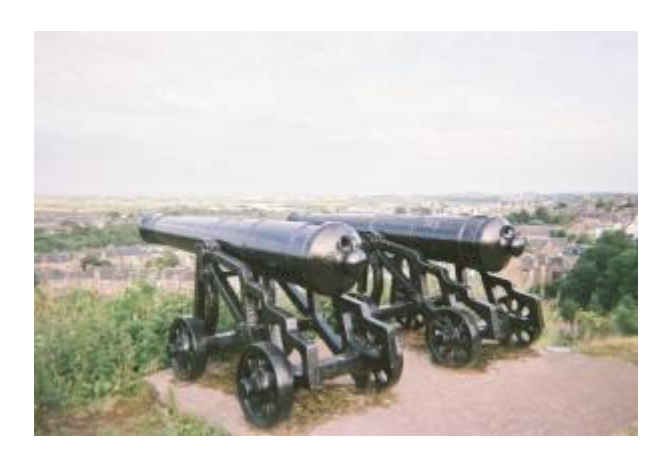
Figure 4: Kelly (2012) The Cannons.

upon years. But I think because the weather was so good that night and it was so warm and hot and everything looked so bright even the beheading...I mean that stone is absolutely clarty [laughter] but it looks so good there." (Kelly 50s)