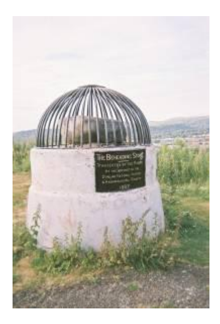
Figure 5: Kelly (2012) The Beheading Stone.

The physicality of the historical artefacts of the area, such as the cannons and the Beheading Stone, but also the castle and the Wallace monument, can be seen