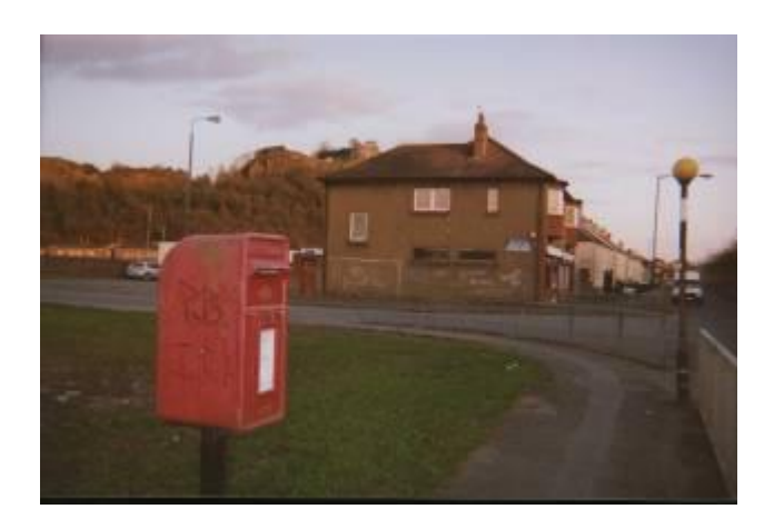
Figure 51: Ciaran (2012) God Save The Queen: IRA Graffiti on a Small Pillar Box Under Stirling Castle.

This resonates with Cresswell (1996) who argued that graffiti could be acceptable, depending on their context. Therefore, graffiti by Bansky is acceptable and considered as art, especially when removed from its urban context, framed and sold at an art auction in London for £750,000, whereby writing on a wall in a housing estate is seen as "Neanderthal" (Huffington Post, 2013).