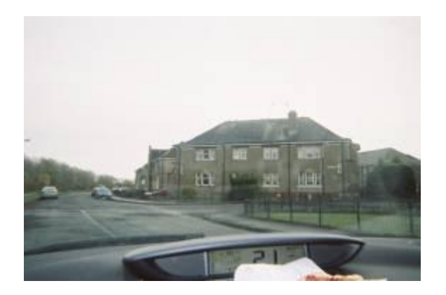
Figure 22: Martha (2013) photo 11 No New Flats Here.

"...it kind of shows the kind of right hand side of the street looking at the photo 12 the right hand side of the street is where all the new flats are the new campus is ehm all the new regeneration if you go to the left hand side of the street its all the original houses original shops and behind those are photo 10 and 11 which are all the old houses that have been in the Raploch for years which are still very run down..."