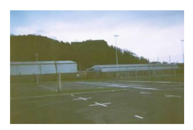
Figure 13: Victoria (2012) Untitled.

For example, Victoria created this photo below showing a car park and a supermarket, behind which is the castle hill.