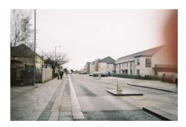
Figure 20: Martha (2013) photo 12 There are Two Sides to Every Story.

Similarly Martha perceived the difference between the new and the old, making a series of photos and photo titles to illustrate this viewpoint. The numbering of the photos is kept in this instance to clarify which photos Martha is referring to: