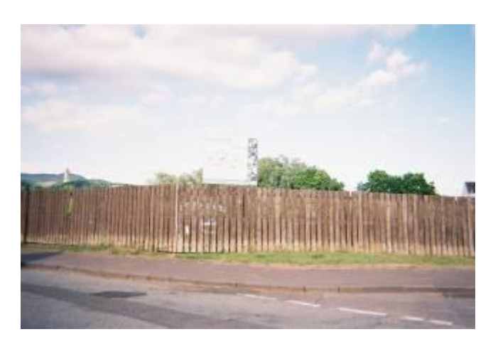
Figure 44: Emily (2012) photo 13 Untitled.

Similarly, Jean-Luc made a photo of a sign by Community Enterprise, which was set in a field. He found that the cost of the sign was more than the upkeep of the area it is dedicated to: