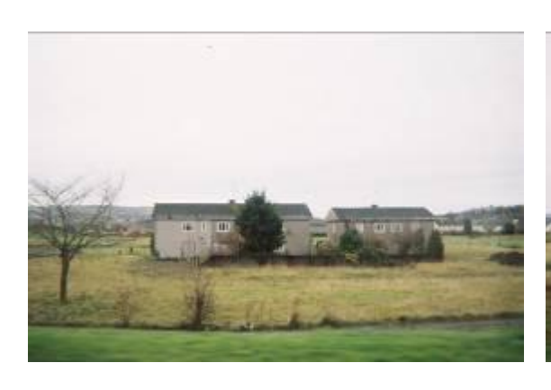
Figure 9: Martha (2013) Derelict.