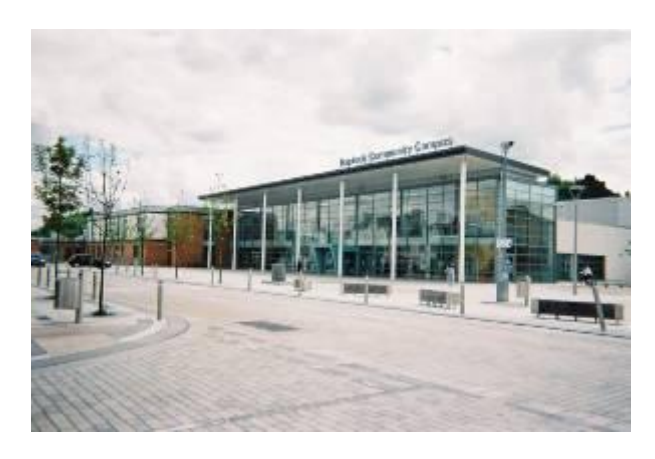
Figure 27: Jean Luc (2012) Campus Front.

"I said I think as a stand alone it looks quite nice and it looks clean and and organised and so does the campus. The campus looks very and its very well maintained cause something there is nae paper nae rubbish or anything so its so mean its very clean and everything looks very functional and and I don't think it brings anything new to the area I still think like the sandstone buildings are far nicer then these wooden and concrete monstrosities, but eh if it was just the campus and nae flats I wouldn't think to much about it but the clash between the two is quite jarring especially its on one side its like left side good and right side bad you know..."