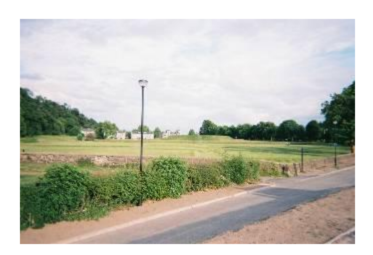
Figure 3: Kelly (2012) King's Knot: Known locally as 'cup and saucer'.

"...you could go up the back way, over by the back walk, and down and that was you in the cup and saucer. We used to do it every Sunday." (Kelly 50s)