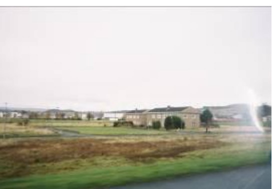
Figure 10: Martha (2013) Delayed Renovation.