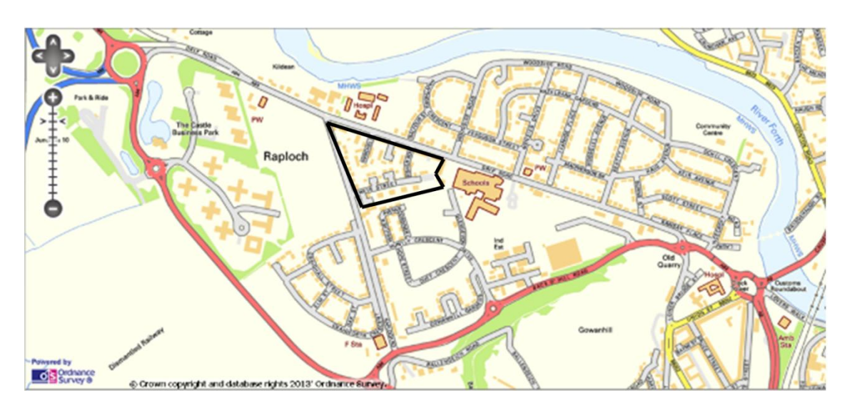
Map 3 - Site 5 of the regeneration within Raploch (outlined with thick black line)