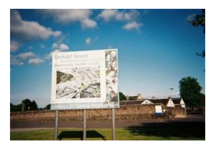
Figure 43: Emily (2012) Untitled.

"...it's like an old sort of hospital but it's like creating 21st Century neighbourhood that sign has been up for years and (laughing )and it's like this singular thing it's like this parks that they are supposed to get developed that one as well no. 13 (photo) its suppose to be a home." (Emily 20s)