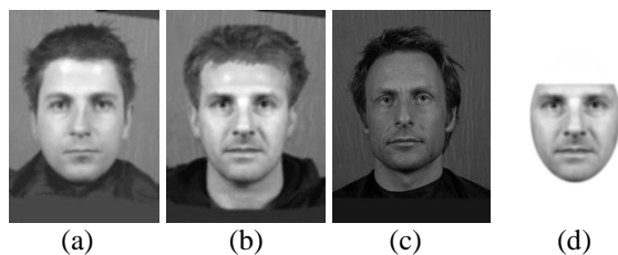
Figure 2. Example stimuli from Experiment 1. (a) composite face evolved using a standard model. (b) a face evolved of the same target using a tailored model built from the witness's description of 'spiky hair', 'chiselled jaw' and 'large nose bridge', (c) a photograph of the target face and (d) an example internal features composite used in the evaluation.

Participants were very familiar with the photos of the target set, correctly naming them 97.2% of the time. Composites constructed using the standard face models were correctly named on average quite well, at 35.2%; those using a tailored model were much better, at 54.2%. Example composites are presented in Figure 2. A two-tailed paired samples t-test applied to the participant data confirmed that the tailored models performed significantly better than the standard variety, t(17) = 6.03 , p < .001 ; the relatively weaker items analysis approached significance, t(5) = 4.43 , p = .06 . An analysis of the incorrect names mentioned by participants was included, which provides an indication of guessing, and was very similar across both conditions ( M \approx 14\% ). For internal feature composites, identification was significantly better for the tailored model ( M = 37.3\% ) compared with the standard ( M = 24.5\% ), t(16) = 2.85 , p = .012 , by-subjects. While the items analysis was not significant, a more powerful by-item test was run with the type of task (complete composite / internal features) as a between-subjects factor and the type of model (standard / tailored) as within-subjects. The ANOVA indicated that tailored models were better, F(1,5) = 7.10 , p = .045 ; all other F s < 2.34 , p > .1 .