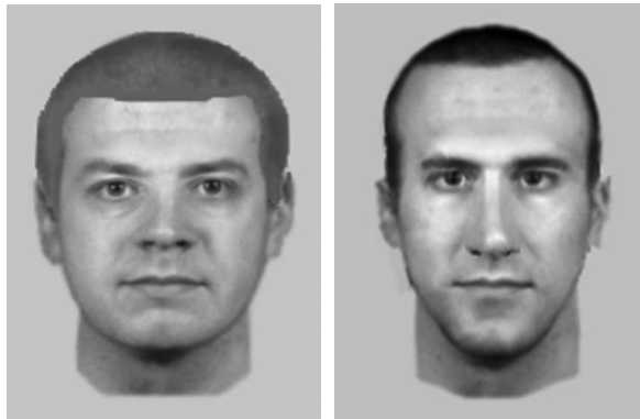
Figure 4. Example composites of the cricketer Simon Jones who plays for England. A composite constructed from a standard model (72 faces) is on the left; from a tailored model (50 faces), on the right.

Complete composites turned out to be identified slightly better from the standard ( M = 31.8\% ) than the Tailored ( M = 26.0\% ) model. However, tailored models ( M = 32.3\% ) were much better identified than standard ( M = 23.4\% ) for the more important, internal