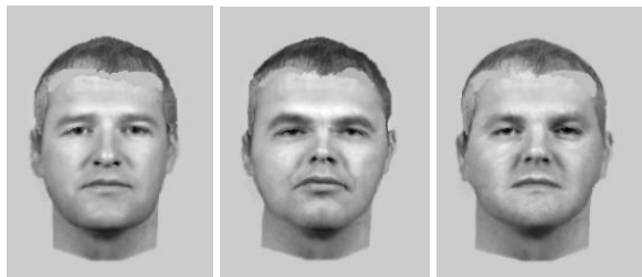
Figure 3. Example composites of the British footballer, Wayne Rooney. They were evolved from tailored models of size 30, 50 and 70 faces (from left to right).

Example composites produced are presented in Figure 3. Identification was lowest from composites evolved from the largest model ( M = 63.7\% , SD = 32.3\% ); it was about 10% better from the smallest face model ( M = 71.6\% , SD = 19.8\% ) and better again by a similar amount from the intermediate one ( M = 81.4\% , SD = 13.6\% ). A repeated-measures ANOVA of these subject data was significant for model size, F(2,32) = 5.9 , p = .006 , and simple contrasts of the ANOVA confirmed that the 50 face model was superior to the