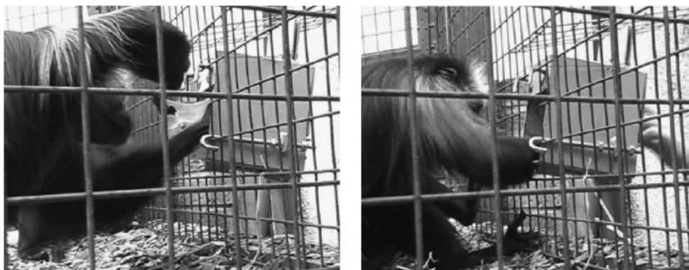
Fig. 1. Stills from the pull (left) and push (right) demonstrations.