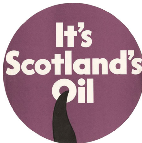
Figure 3: Scotland's Oil : The SNP's campaign to keep a larger share of Scotland's offshore oil was launched in September 1972. This image (SPA/761/4)c. 1973 is provided courtesy of the Scottish Political Archive, University of Stirling, Stirling FK9 4LA.

To date Crawford and Boyle's Opinion offers the most detailed and substantive analysis of Scotland's potential legal status in international law following independence. States are legal entities in international law with the capacity to enter into treaty with other states. For example, when Scotland entered into the Treaty of Union in 1706 with England it did so as an autonomous