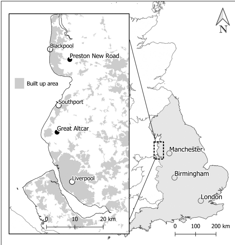
Figure 1. Map of Great Altcar.

About 80 percent of energy used to meet global demand is generated through the extraction of fossil fuels from the subsurface (Ritche, Roser, and Rosado 2022), a practice typical across rural landscapes. As efforts grow to decarbonize energy systems and achieve net-zero, proposed solutions such as geothermal energy and storage, as well as carbon capture and storage also depend on underground interventions for implementation, (Stephenson et al. 2022) and are crucial for supporting uninterrupted energy supplies (van Gessel et al. 2021). Essentially, underground interventions have been