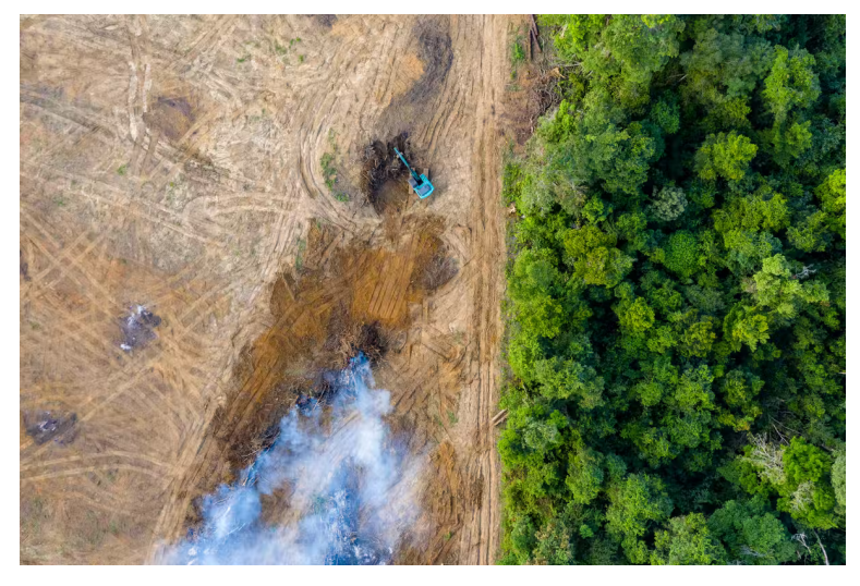
Forests are still being bulldozed to make way for agricultural land for beef production.

This would lead to more food production, with all the benefits forests bring and without the environmental burdens of intensive farming such as fertiliser, water use or the growing of additional feed. Beef farming contributes to climate change by emitting greenhouse gases, but as these fungus-inoculated trees grow, they draw down carbon from the atmosphere, helping in our fight against the climate crisis. So, as well as producing more food, the process can also enhance biodiversity, aid conservation, act as a carbon sink for greenhouses gases and help stimulate economic development in rural areas.