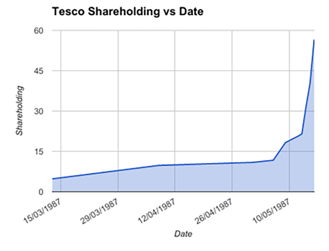
Figure 3. Acquisition of Hillards' Shares by Tesco (data sourced from the Financial Times).

The share price of Hillards went from 178p in early February to an eventual take-over price of 465p. This is a marked difference, and a significant premium for the shareholders. From the point of view of the shareholders this would reflect a good price for what would appear to be a highly regarded regional chain. The public campaign must have contributed to this increase in share price, in effect extracting a maximal (or near maximal) price from Tesco to acquire the firm. Though Hillards disappeared, the shareholders did well.