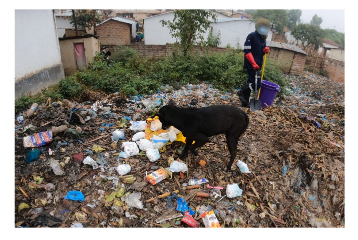
Fig. 1. Stray dog rummaging through disposable diaper waste on an open dump site in Ndirande, Blantyre, Malawi.

To date, there has been minimal research into understanding the trends in, and challenges behind, the use of disposable diapers in LMICs. Given the increasing global usage of disposable diapers and their potential to act as a reservoir for pathogenic microorganisms, there is a pressing need to raise awareness of the problems associated with diapers in the environment. Here, we critically discuss the challenges associated with the use of disposable diapers in LMICs, drawing particular attention to common disposal practices employed by caregivers, and the resultant impacts on environmental and human health.