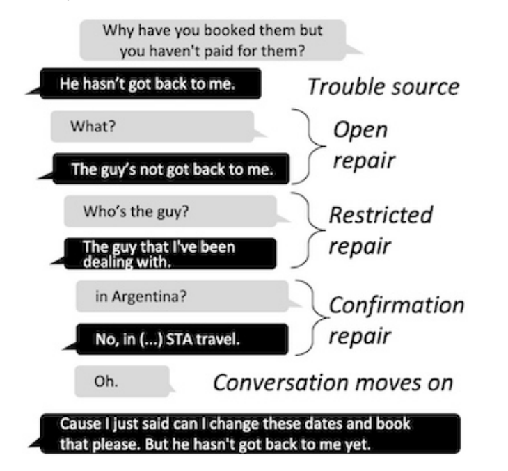
Figure 1: An example of an extended repair sequence, based on Rossi Corpus of English, RCE08 20000a-c (Rossi & Kendrick, 2013). Click image to enlarge.

In real conversations it is often the case that people do not understand or simply do not hear each other. To help us deal with this, we have systems of "repair" that get the conversation back on track (Schegloff, Jefferson & Sacks, 1977; Dingemanse et al., 2015; Micklos, Walker & Fay, 2020). These systems are quite predictable. For example, in Figure 1 below, A and B are discussing the booking of holiday tickets: