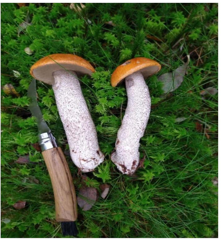
Figure 1 An example of large epigeous sporocarps formed by ectomycorrhiza. The edible fungi species Leccinum versipelle found growing in September 2020 with Betula pendula in Scotland, UK.

arrivals were likely dominated by non-vascular land plants growing in damp environments and on continental surfaces ( Rubinstein et al. 2010). Incredibly, the first fossil evidence for fungi considerably predates this. Microfossils from estuarine environments, dated to1–0.9-billion years old have been located in Canada and assigned to the species Ourasphaira giraldae (Loron et al. 2019). It is possible that terrestrial fungi may have predated terrestrial plants but the first evidence for mycorrhizae also appears in the Ordovician period, around 460 million years ago with the appearance of Glomales-like fungi. This raises the intriguing prospect that mycorrhizae may have had a pivotal role in the colonisation of land by plants and have been integral in their evolutionary history.