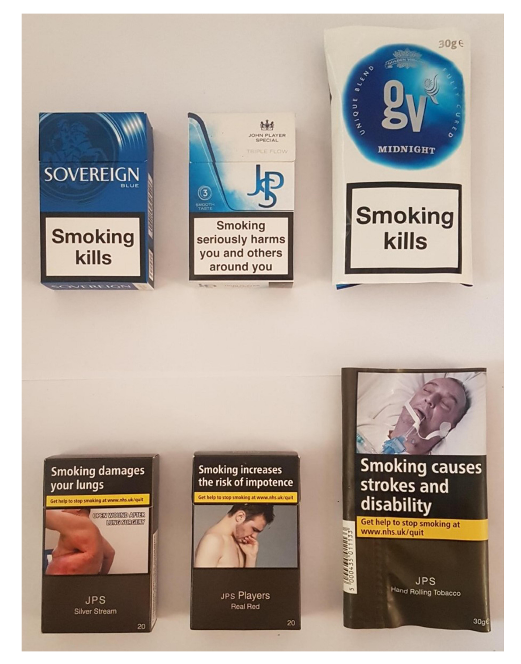
Figure 1 Examples of flip-top cigarette packs and rolling tobacco pouches pre-standardized packaging (top row) and post-standardized packaging (bottom row).

2020 for the second<sup>16</sup>). Academic topic experts were also contacted.