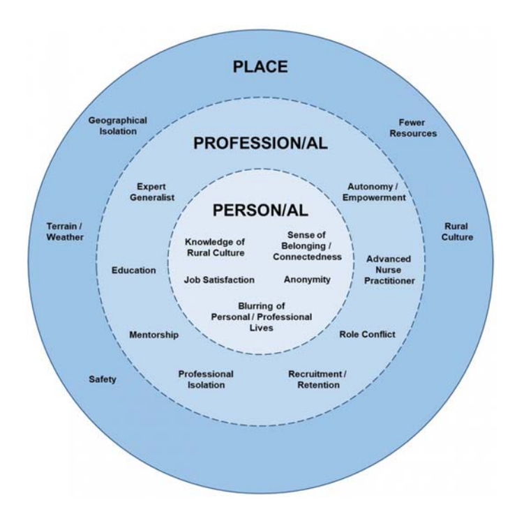
Figure 2: MacKay's 3P model of factors influencing rural and remote nurses' decision making.