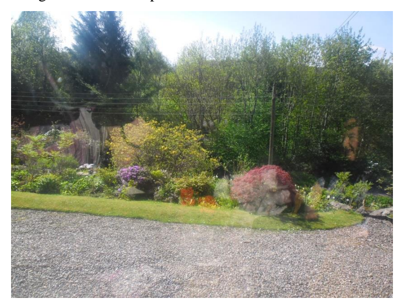
Figure 9. Daily Garden

of her garden. There she discussed the importance of her garden and overall themes of being outside. She reported she liked to sit outside.