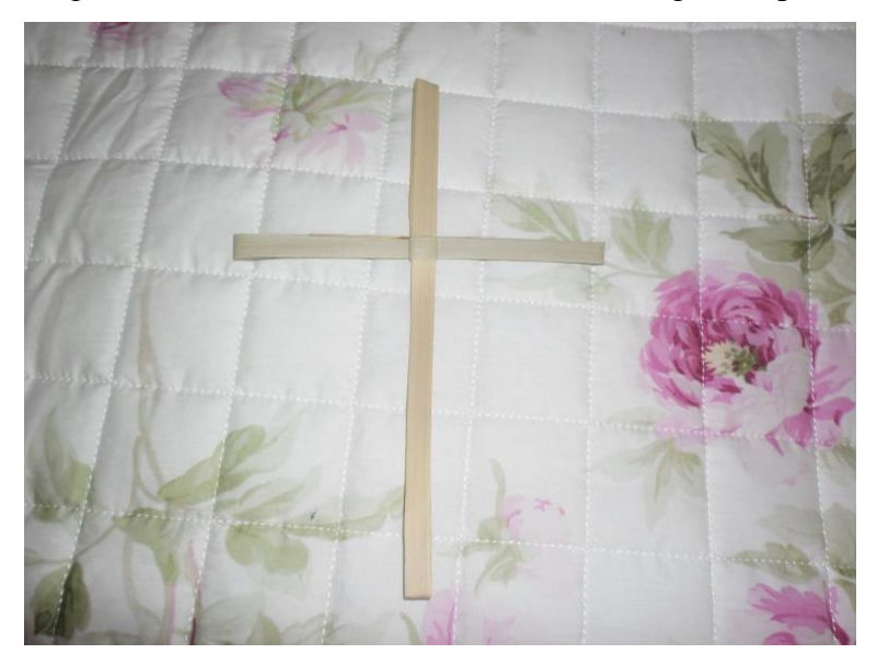
Figure 4. Cross as Representation of not being Able to Attend Church

were struggling with stability during these times. For example, some reports explained that OP #06 could no longer go to the pub, as demonstrated in Figure 6. OP #01 could no longer leave her residence to attend church. Figure 4, picture of a cross, portrays this.