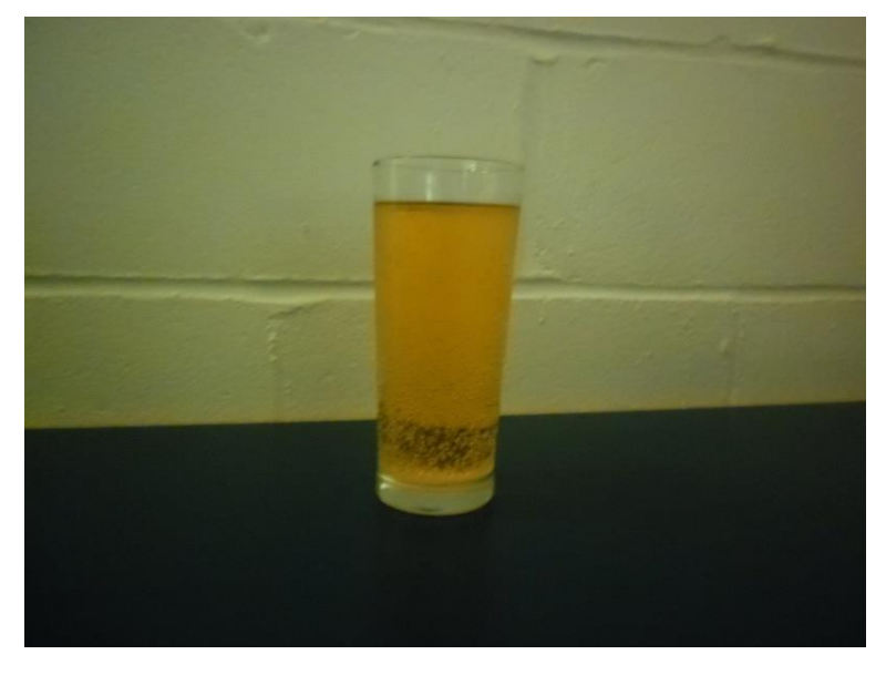
Figure 6. Pint and Loss of Independence at the Pub

Figure 6, the photograph of his Pint, shows an example of his loss of independence through no longer being able to take walks to the pub.