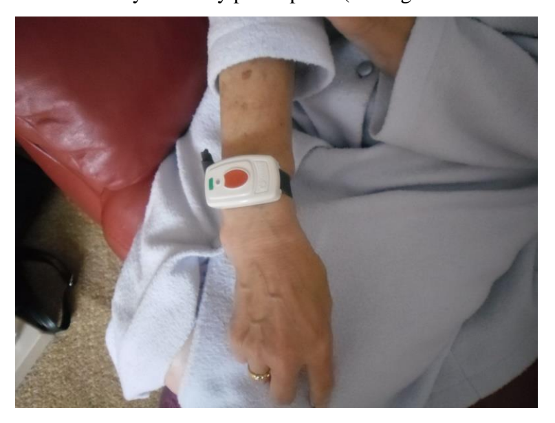
Figure 8. MECS

attention of staff. This assistive technology also had an impact on the success of people staying in their own homes for as long as possible and promoted added independence and added security for many participants (see Figure 8 for OP#15 and her device).