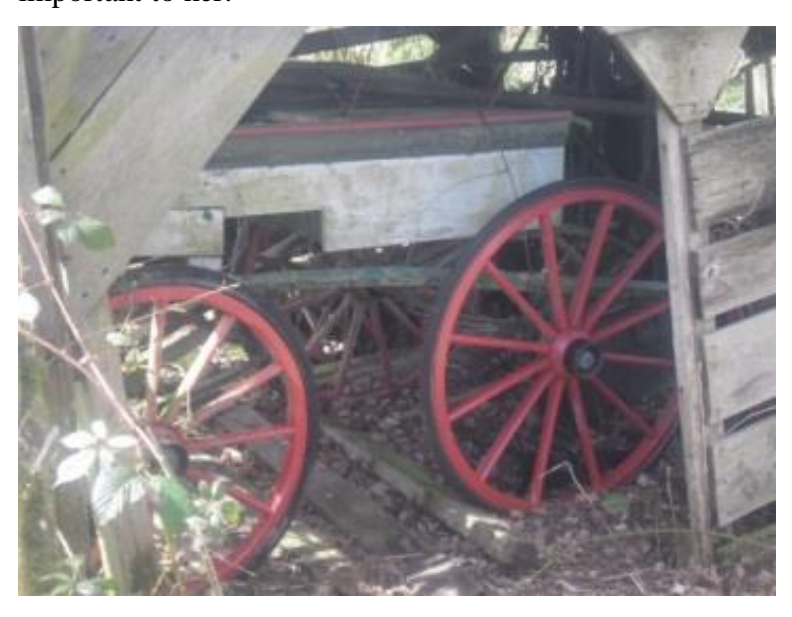
Figure 14. The Cart

OP #02 informed the researcher that it was important to remain in her own home. She displayed emotion when she discussed why her home was important during discussion with photographs. OP interviews included discussions of photographs that resulted in triggering additional unrelated topics that did not match the photograph being discussed. This was important in understanding how and why decisions about care, and resource utilisation, were made. One example of this discussion was illustrated in Figure 14 "The Cart." OP #02 talked about what was in the photograph. She ended up speaking about other things, seemingly unrelated, but had strong links and emotion to the photo. The photo brought back ties to her late husband and this was why staying in the home was important to her.