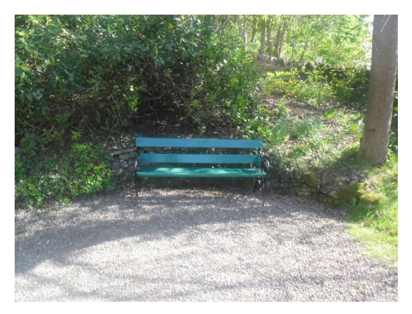
Figure 13. The Bench

This series of photographs tracked her healing process as she ranged from bedbound to mobile. She progressed over the three weeks' with minimal weight and no blankets touching her wound. Then, a brace, but progressed to no brace and to longer exercise (walking out to the road). The photos tracked her progression along with her perception of her story through the images. There are a series of wider issues of influence that GST highlighted her lived experiences that were linked to relationships and helped balance homeostasis. QoL was raised and lowered and influenced by: environmental factors, relationships and support networks. This had influence on the paid care she received, and an informal carer in the home allowed her to return to the home setting and have her friends to visit. She also had what she needed to exercise (although she found this to be limited as she was a former hillwalker).