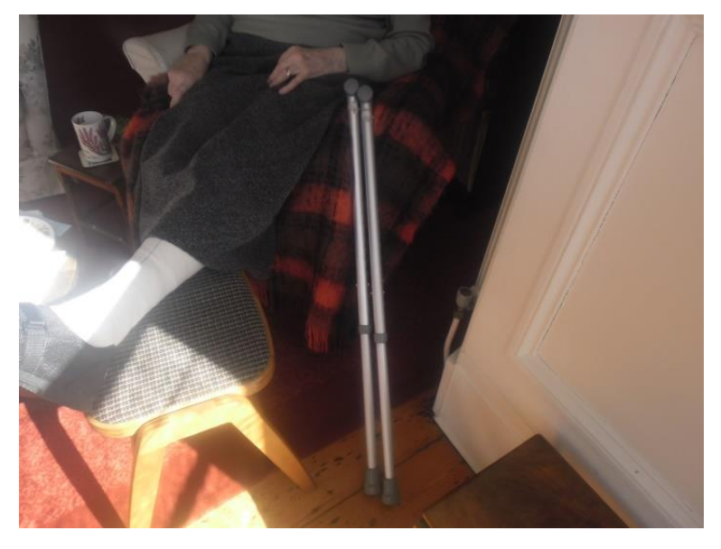
Figure 12. Healed With No Foot Brace

Then, Figure 12 shows OP #05 when she has healed to the point of needing no brace.