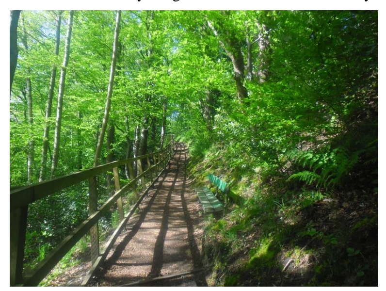
Figure 5. Hillwalking and Loss of Independence

Similarly, OP #05 was no longer able to hill walk. She liked to be outdoors but was unable to do many things she once did but her mobility increased as time progressed.