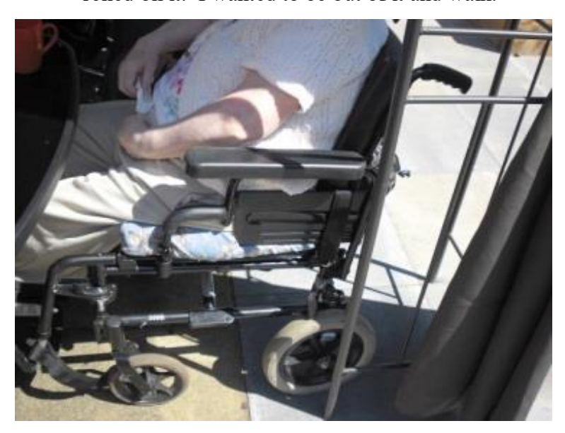
Figure 7. Wheelchair

"Hated the sight of it and I didnae [did not] use it when I first got it. I didnae [did not] want to be associated with it-horrible looking thing. I was sad to be relied on it. I wanted to be out of it and walk."