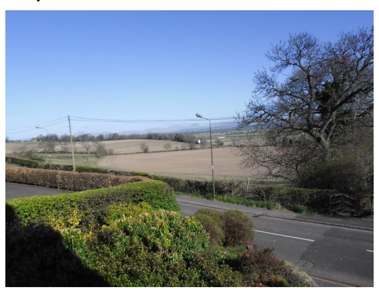
Figure 2. Treasured View from Front Window

A challenge with interviews relates to how non-verbal meanings are, often, left out of conversations (Prosser & Loxley, 2008). This is important for vulnerable populations and those often overlooked in the research process and it is necessary to seek alternatives. Thus, the use of mixed-methods was more inclusive of disadvantaged populations. For example, this photograph, Treasured View from Front Window, (Figure 2) was taken by OP #03. He was recently diagnosed with Alzheimer's disease (AD), and he was able to articulate thoughts and feels better on some days than others. He reported that this view offered him feelings of "contentment...happy feeling...interesting to watch the different seasons change." The photograph stimulated conversation that he would not reside where he did if he had a view of "houses or factories." The photograph pulled together information that he did not initially report. He also spoke of "a very nice situation and a lovely view" and said it was nice to see farmland.