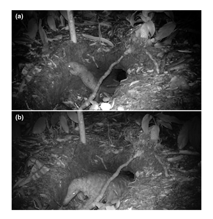
FIGURE 2 (a) White-bellied ( Phataginus tricuspis ) and (b) giant ( Smutsia gigantea ) pangolins emerging from the same burrow

females with infants that were never observed together. Six of the burrows were frequently visited by a large lone female; with whom the male was observed walking, feeding and interacting during successive nights. Burrows were rarely used on two successive nights. Two hollow trees were occasionally visited.