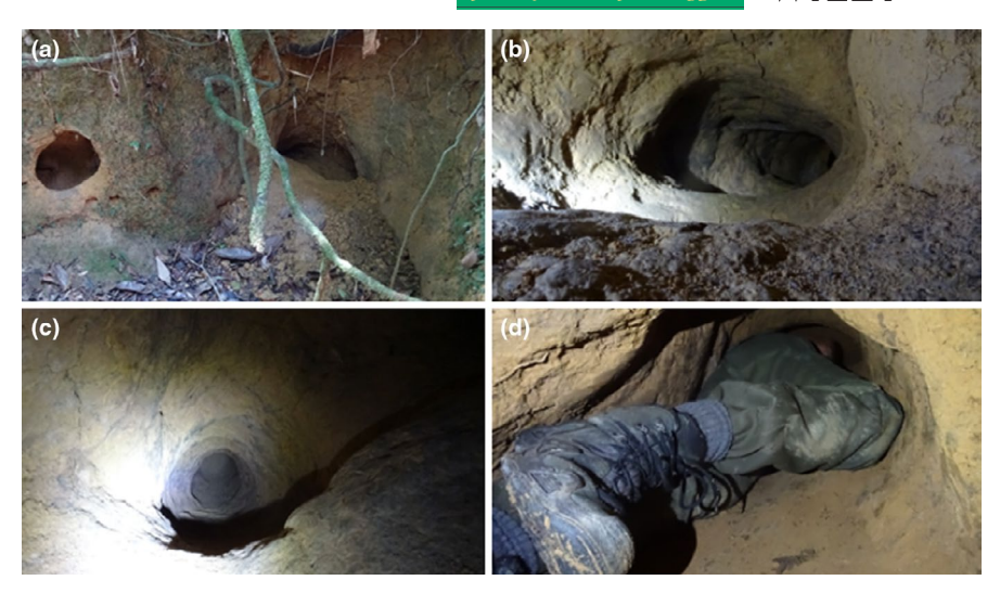
FIGURE 1 In (a) two of the 10 entrances of a giant pangolin burrow complex; in (b) a vertical gallery (50– 100 cm wide, 20 m long and 3 m steep); in (c) a transversal gallery (40–100 cm wide; >25 m long); and in (d) team leader for scale [Colour figure can be viewed at wileyonlinelibrary.com]