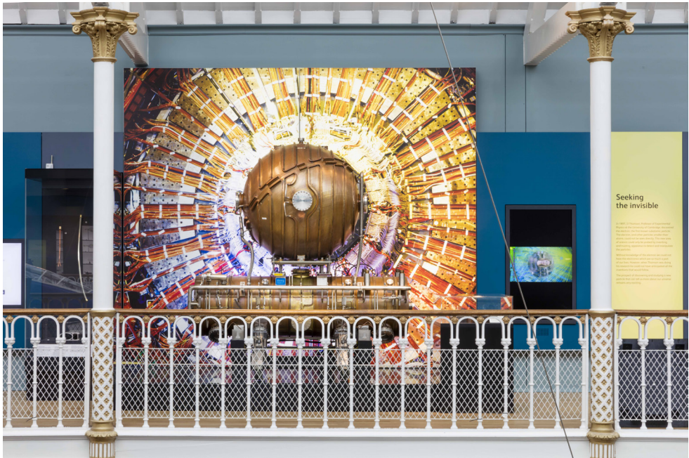
Figure 6. The Large Electron-Positron Collider accelerating cavity from CERN in Enquire (T.2014.34). National Museums Scotland.

By way of conclusion, we offer some lessons learned about three particular relationships that contemporary collecting runs through: between science and art; between structure and flexibility; and between project management and (other) museum managements.