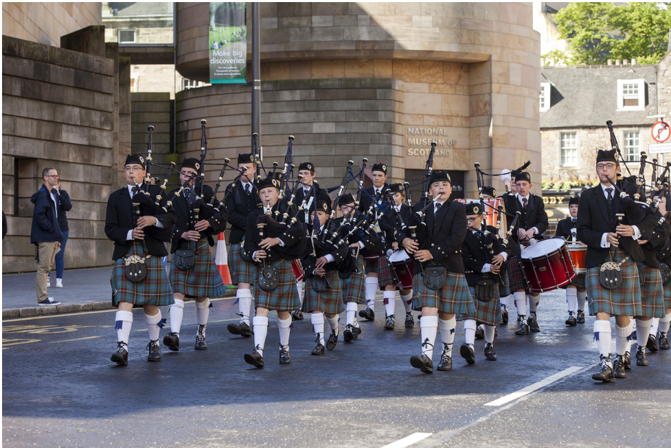
Figure 1. Pipers on Chambers Street herald the opening of the new galleries in the National Museum of Scotland, 8 July 2016.

Key words: contemporary collecting, National Museum of Scotland, project management, reflective practice