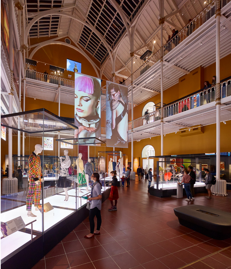
Figure 4. The catwalk-style display in Fashion and Style exhibiting contemporary fashion acquisitions.

Museums created during the great expansion of the nineteenth century were not only sites for connoisseurship, but also places of inspiration for both arts and industries. This was especially so for our predecessor institution, the Edinburgh Museum of Science and Art and its sister museum in South Kensington. Similar museums elsewhere in Europe include Lyon's Musée des Tissus and Musée des Arts Décoratifs , both created by the city's Chamber of Commerce, or, later, the Museo Nacional de Artes Industriales , now Museo Nacional de Artes Decorativas , in Madrid. The rupture of the Avant-Gardes led many museums to focus on the past, paving the way to the separation of museums specifically dedicated to Modern Art.