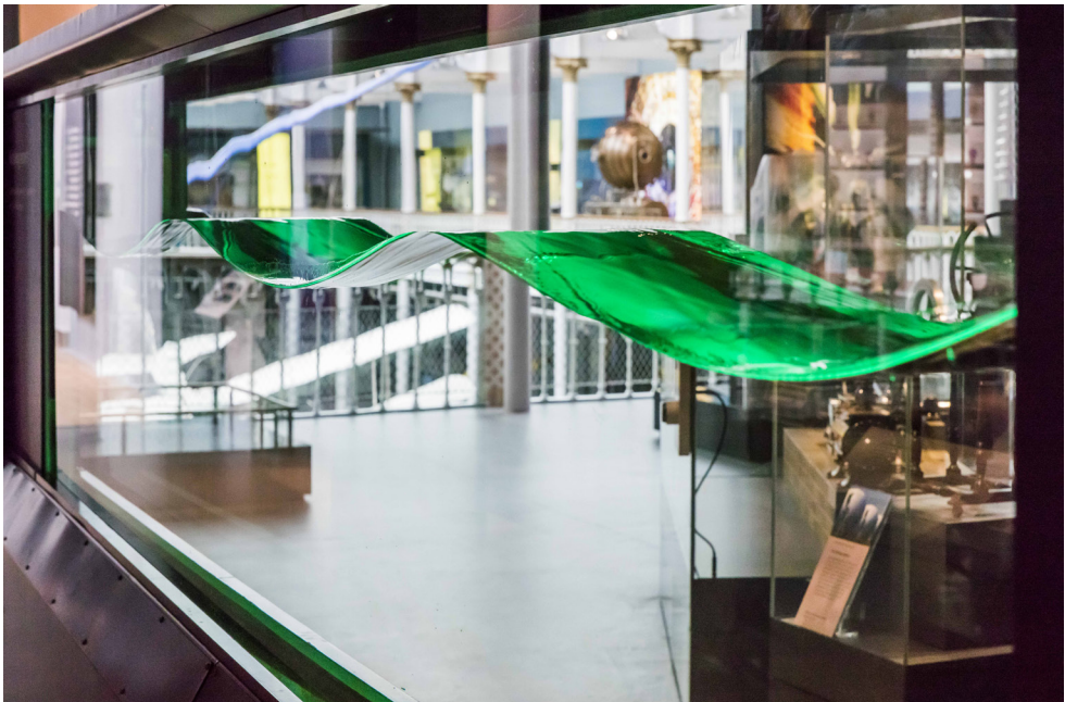
Figure 5. The bespoke commissioned interactive wave tank in the Energise gallery.

One new object illustrates the way of working that brought this material to the Museum. Elsa Cox, lead curator on Energise , wanted to bring in recent material to enhance the already strong energy collections, to realize the contemporary objectives of the project and to play on a politically relevant issue. The department had an existing relationship with the University of Edinburgh, where engineer Stephen Salter and colleagues had pioneered marine renewable energy since the 1970s (Salter 1974). The famous wave energy converter ‘Salter’s Duck’ was already on display in the existing gallery next door, Scotland: A Changing Nation , and this was transferred to Energise . This introduced the time-consuming problem of back-filling an existing display, a workflow that is not always accounted for in project planning, and in this case, was a lesson learned.