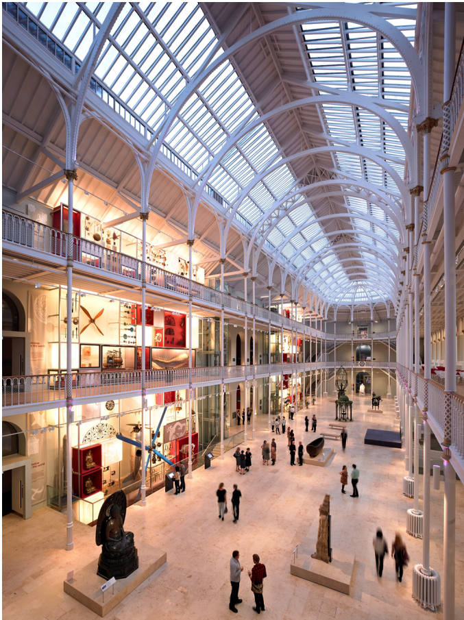
Figure 2. The central atrium of the National Museum of Scotland's Victorian building showing the 'Window on the World' display, redisplayed in 2011.

Our central site comprises a 1998 building housing the Scottish history and archaeology galleries, and the former Royal Scottish Museum, a more traditional Victorian museum building. In 2008 the two buildings were conjoined in branding terms as the 'National Museum of Scotland', and began a major programme of capital development of the displays in the older building.