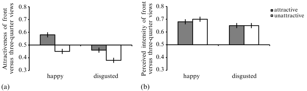
Figure 2. (a) The effects of expression and attractiveness on preferences for front versus three-quarter views of faces, and (b) the perceived intensity of the emotions shown in front versus three-quarter views of faces. Bars show means and SEMs. 0.5 on the y -axis = chance.

All of these main effects and interactions, apart from the main effect of sex of judge, were qualified by a three-way interaction among attractiveness of face judged, expression of face judged, and judgment type ( F_{1,288} = 7.93 , p = 0.005 , partial \eta^2 = 0.027 —see figure 2). There were no other significant effects (all F s < 1.60 , all p s > 0.20 ).